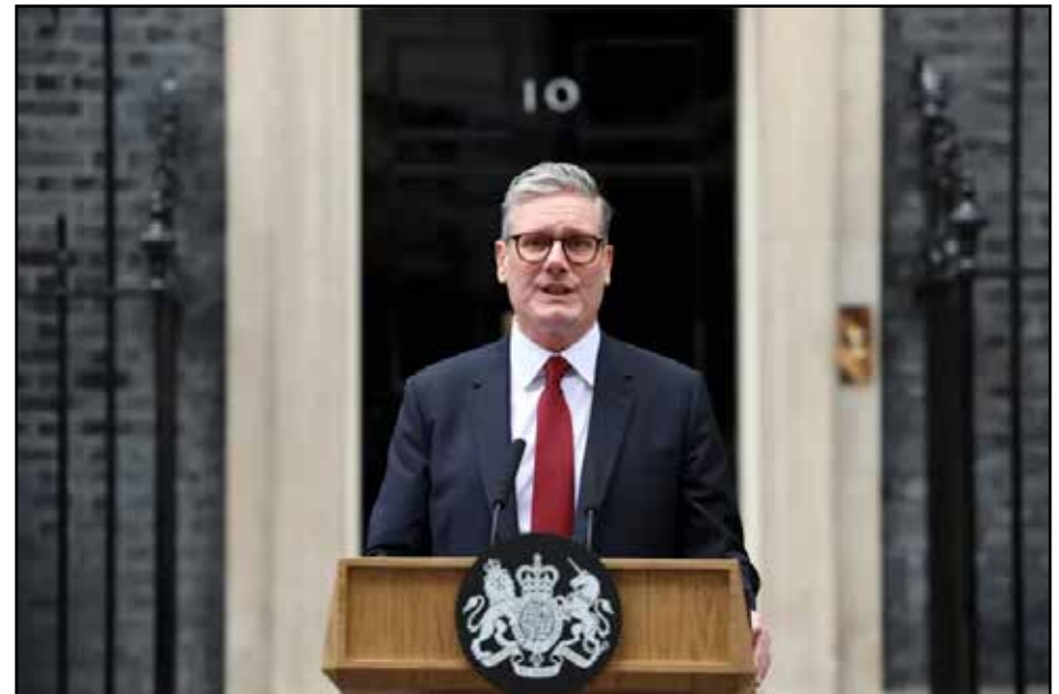
STARMER: I'm not prepared to continue with gimmicks that don't act as a deterrent"

"The chances were of not going, and not being processed, and staying here therefore in paid-for accommodation for a very, very long time."