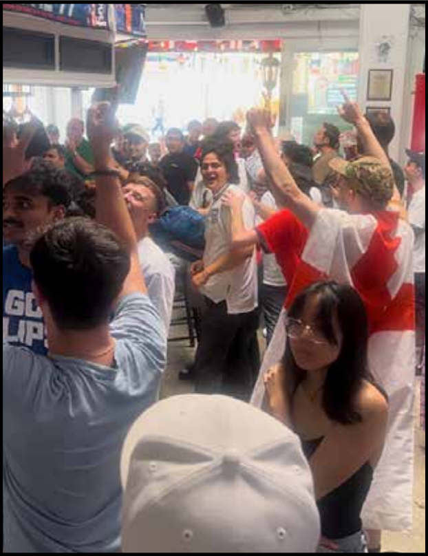
CATHARSIS: euphoric crowds at The Britannia (top) and Ye Olde King's Head (right)

LOCAL FOOTBALL FANS were out in force this week as Euro 2024 fever gripped Southern California.