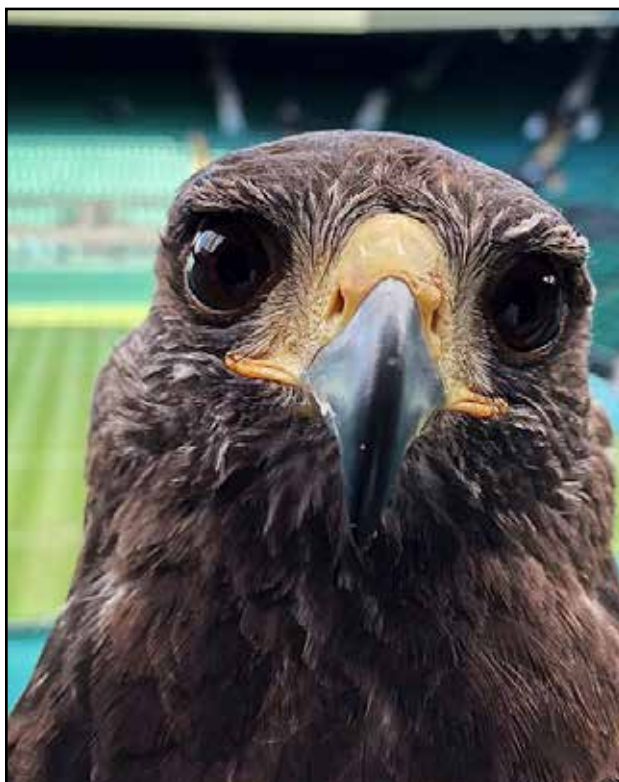
TOP BIRD: Rufus (above) and (below) Salma Hayek watched Emma Raducanu exit the tournament

Rufus has become something of an avian star at Wimbledon, his picture taken by countless photographers and television crews. He even has his own Twitter account @RufusTheHawk.