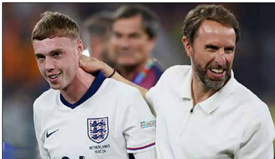
HOT COLE: Palmer provided the vital assist for the Watkins winner

It also gives England cont. on page 19, col. 5