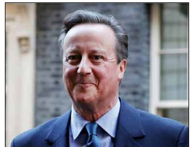
CAMERON: "I will continue to support the party"

It means Andrew Mitchell will be the new Shadow Foreign Secretary. cont. on page 5, col. 1