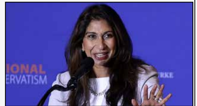
Braverman called for "core Conservative policies"

The Conservative vote dropped from 13.9m at