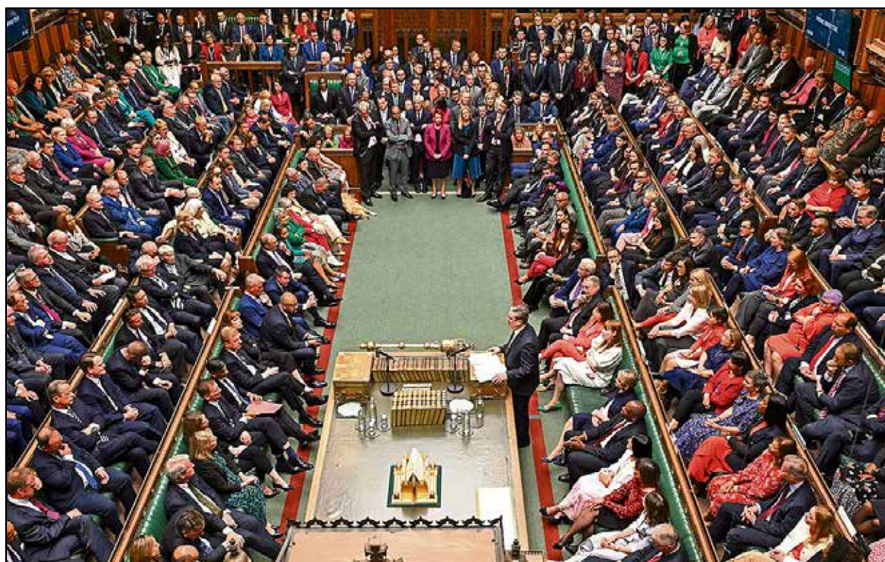
STANDING ROOM ONLY: the scene in the House of Commons on Monday

the Commons since becoming Prime Minister, Sir Keir Starmer said: "Mr Speaker-elect you preside over a new Parliament, the most diverse Parliament by race and gender this country has ever seen."