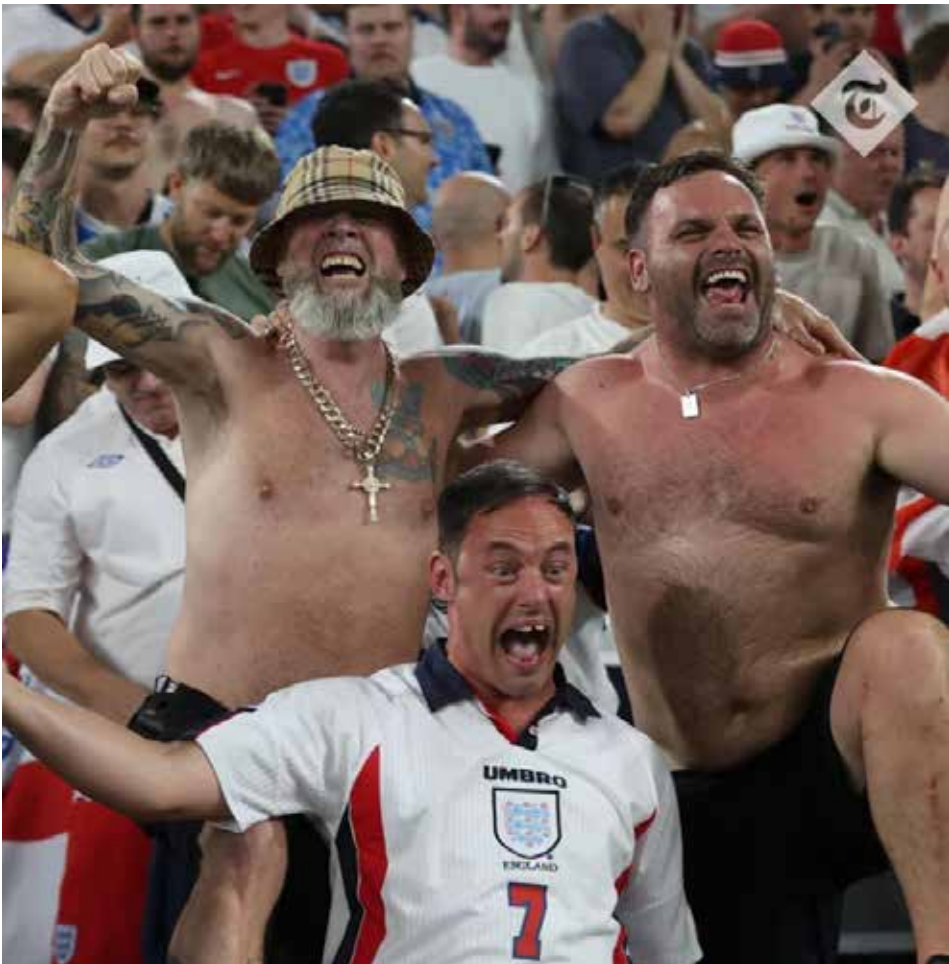
Joy Unconfined: England fans react to England's late winner in Dortmund