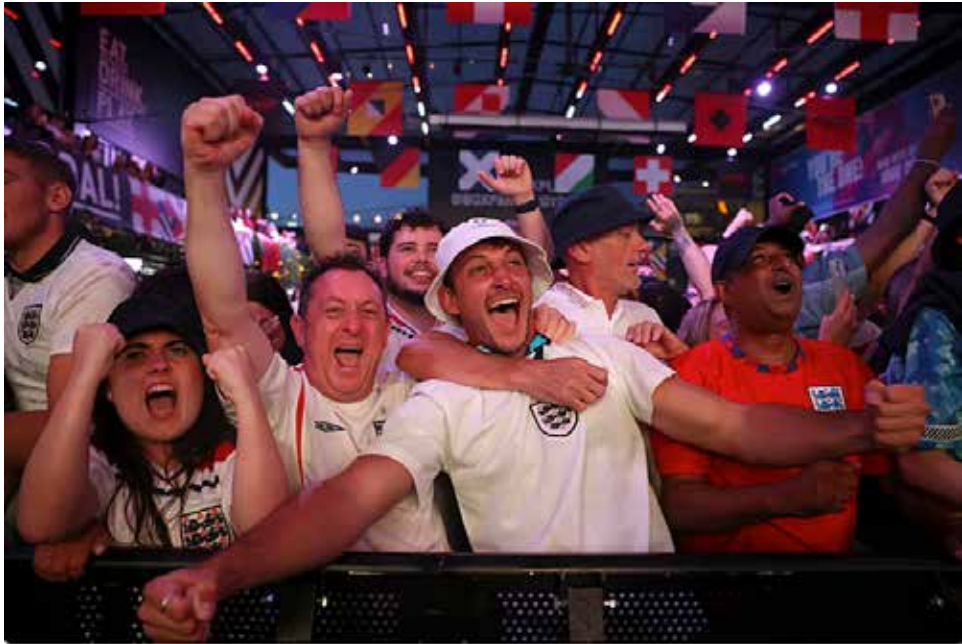
WHOOOPS, THERE IT IS: The scene at a viewing party in a London bar

JUBILANT England fans were celebrating Wednesday night after a large dose of Dutch courage saw the Three Lions roar into the Euro 2024 final.