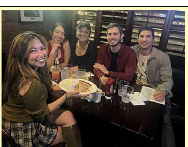
MORE THAN JUST TRIVIA: contestants can also win dessert (top) or the singing contest