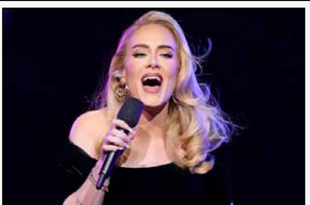
Adele's 100 show residency in Las Vegas will come to an end in November

The star's last album came out in 2021, and she has spent the past two years playing a weekend residency in Las Vegas, recently completing her 90th show at the 4,000-capacity Caesar's Palace.