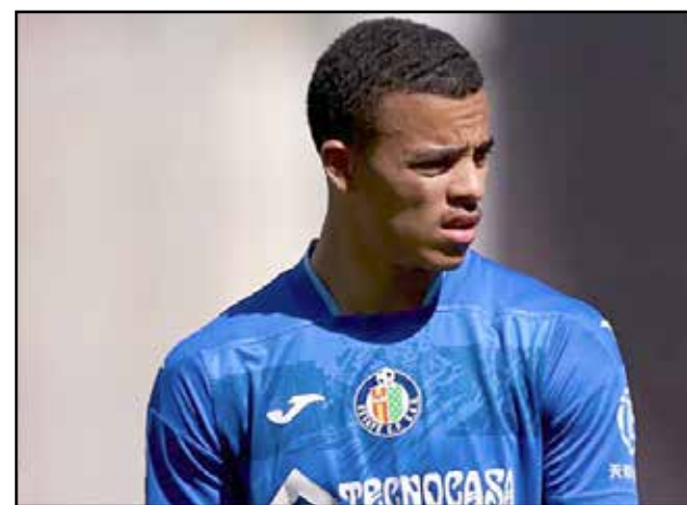
SPANISH STEPS: Greenwood was named Getafe's Player of the Season last term

Marseille face Sunderland in a pre-season friendly on 3 August at Bradford City's Valley Parade, with the Stadium of Light unavailable because of