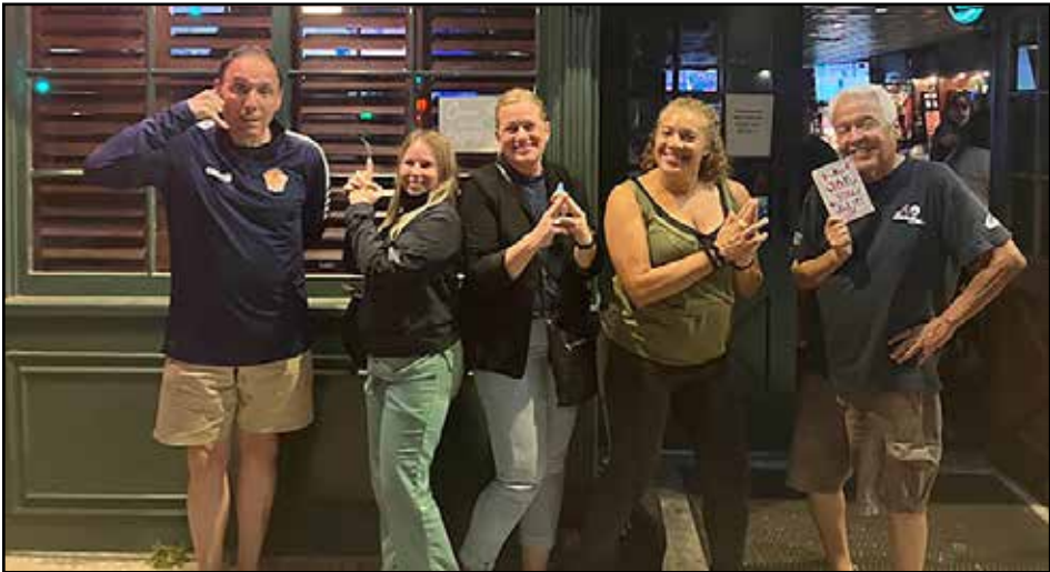
Tuesday Cluesday: winning team Man of the Ear (above) edged out the Anglo-Scottish Alliance (top) who doubtless owed their performance to their prudent choice of reading material between rounds