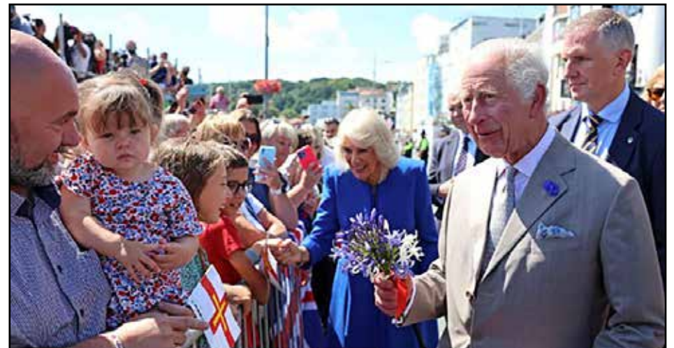
ISLAND DELIGHT: The royal couple enjoyed a joyous, sunny welcome

Before you list your home for sale, get this FREE report with excellent intel & advice on how to sell your home for the most money and how to avoid common & costly mistakes. Free recorded message 310-895-9018 EXP Realty dre#01839192