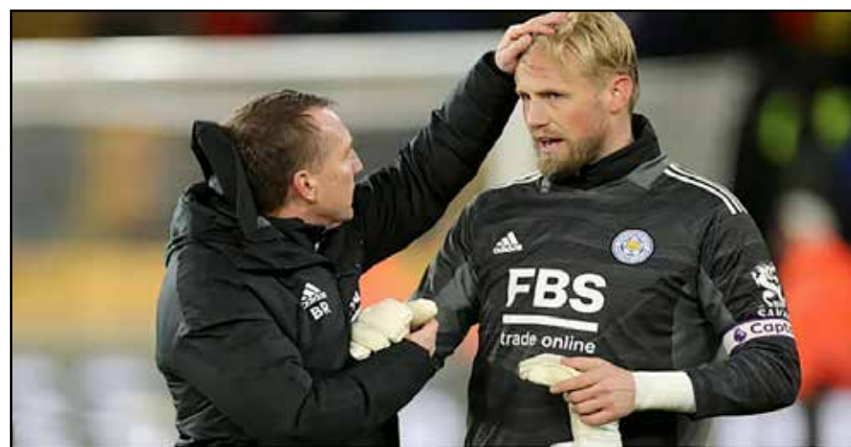
Rodgers and Schmeichel won an FA Cup together with Leicester City

Schmeichel is best known for his 11-year stint with Leicester City, during which the club won an improbable Premier League crown in