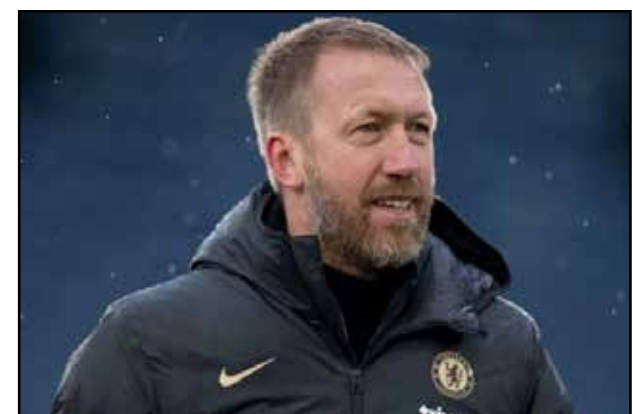
BACK ON TRACK? Potter seemed to be on a rapid rise to the top before an ill-fated move to Chelsea in 2022 derailed his career

"I feel really ready, really excited to be back when the right opportunity comes."