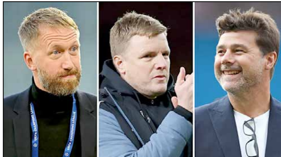
TOP CONTENDERS: Graham Potter, Eddie Howe and Mauricio Pochettino

journey and, as far as we're concerned, Eddie is the man to lead us on that," he said.