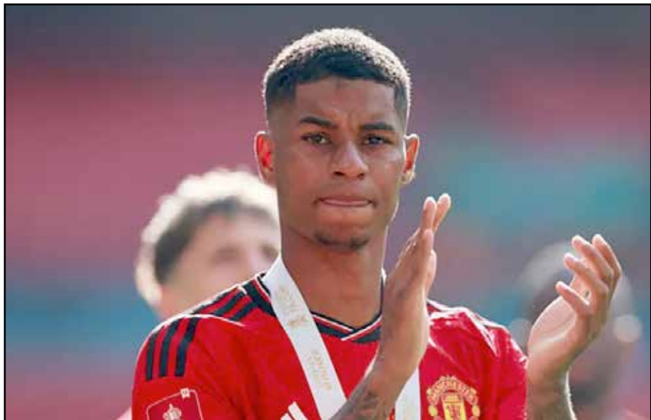
LIVING LARGE: Marcus Rashford has a fleet of luxury cars