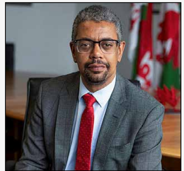
Gething: dogged by questions since he took over

Keir Starmer thanked Mr Gething for his service, adding: "I know what a difficult decision this has been for him, but I also know he has made it because he feels it is the best decision now for Wales."