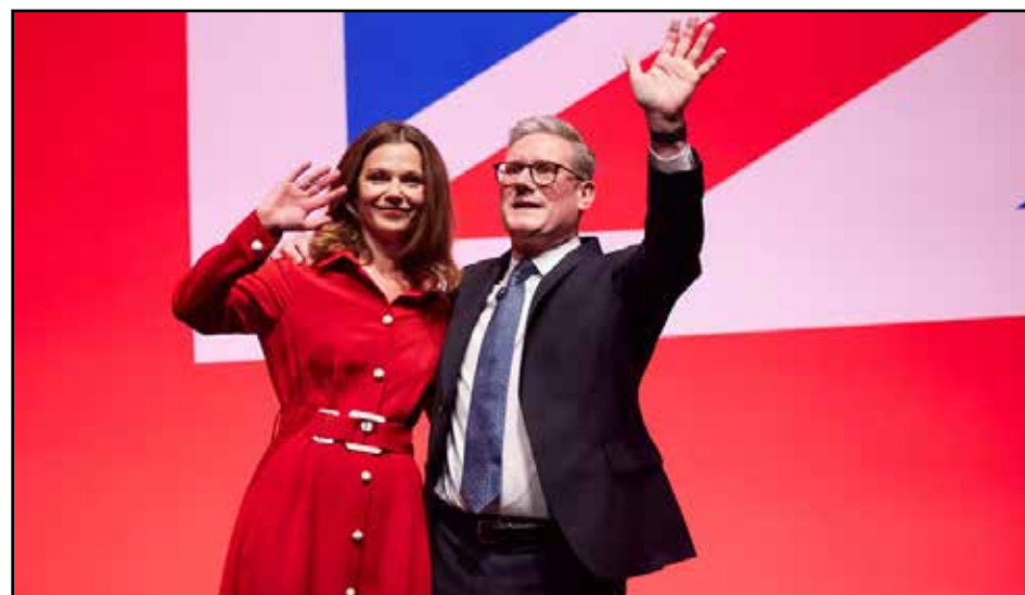
UPBEAT MESSAGE: Sir Keir and Lady Victoria Starmer in Liverpool this week

"Because the British values we stand for, not just the rule of law, but a love for this country and our