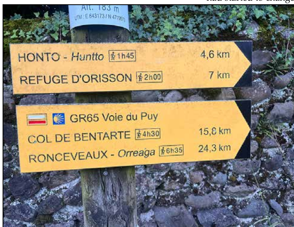
THE START OF SOMETHING BIG: a signpost leaving St Jean Pied de Port