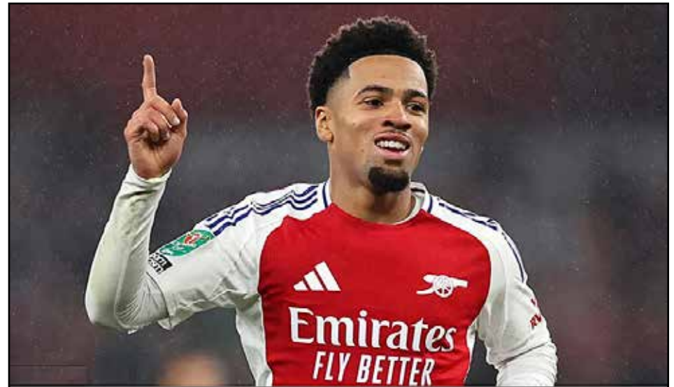
"He is always ahead of what everybody expected," said Arsenal manager Mikel Arteta of 17 year old Ethan Nwaneri