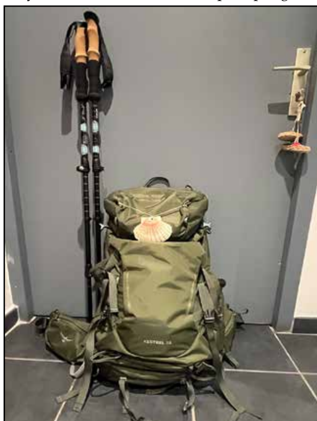
JUST THE ESSENTIALS: a backpack and poles

the Camino was considered one of Christendom's Big Three pilgrimages, along with Jerusalem and Rome. Hostels, albergues and other refuges sprang up to house and feed them overnight. Local churches welcomed them, too. And less savory types sought to prey on them, prompting the