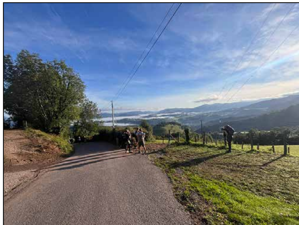
LONG WALK AHEAD: the Camino's first day takes you over the Pyrenees

Knights Templar, no less, to build a string of hilltop safehouses along the route to provide safe haven.