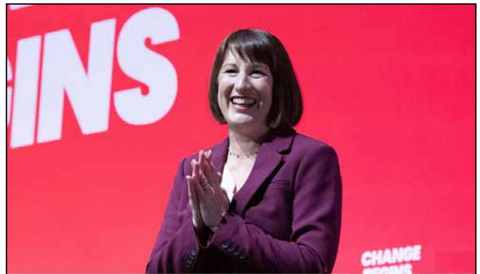
RACHEL REEVES: "My ambition for Britain knows no limits"

"Yes, we must deal with the Tory legacy and that means tough decisions, but I won't let that