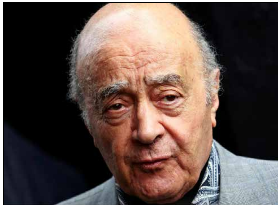
Mohamed Al Fayed died last year at the age of 94

He said he did not hate hippos since he was "conscious we were in their cont. on page 5, col. 1