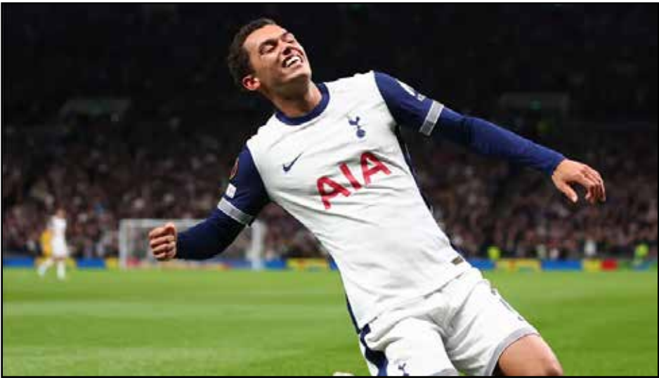
IN THE GROOVE: Brennan Johnson has scored in his last three Spurs games

He handed 18-year-olds Lucas Bergvall and Archie Gray their second Spurs starts but, following Dragusin's