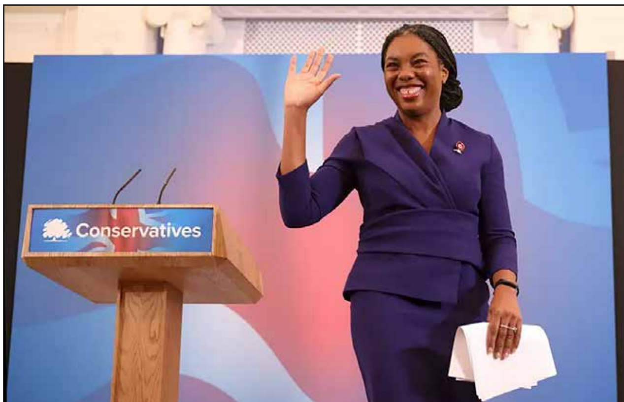
Big job ahead: Badenoch must rebuild Tory morale after their devastating election loss in the summer

Her rise to the top echelon of British politics is the result partly of determination, hard work and a fearlessness that have helped her survive the at times brutal infighting within her party in recent