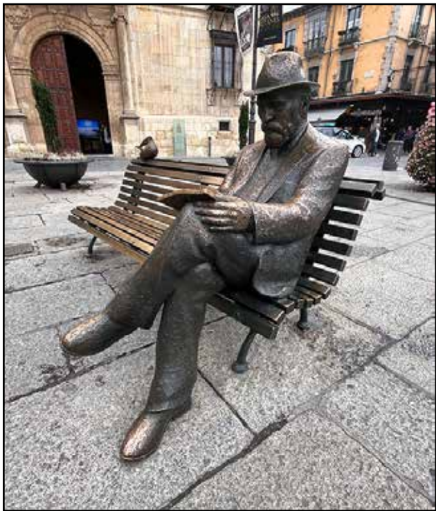
IMMORTALIZED: sculpted in bronze, Gaudí and his sketchbook outside Casa Botines

We had two days here but would gladly have spent a week. But soon enough it was time to get on the road because the final third of the Camino Frances awaited us.