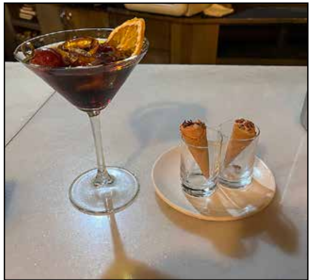
Cervantes 10 Gastrobar: stop by for artisanal vermouth and a foie gras tapa in a cone