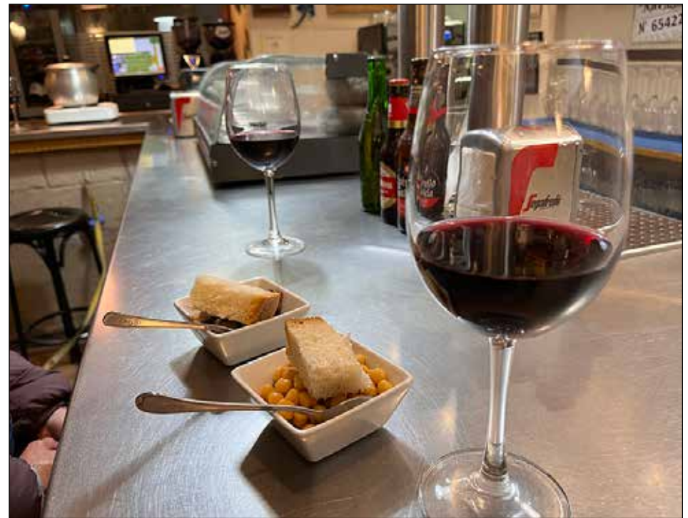
COUNTER INTELLIGENCE: (above) savvy travellers will love the generous tapas to be found in Leon; and (left) snails and a glass of Mencia at Tasca La Rinconada

As is always the case on the Camino, all the action is in the Casco Antiguo (Old Town), and in Leon two areas in particular cannot be missed: the Barrio Húmedo and the Barrio Romántico. One of our favorite stops was Restaurante Ezequiel , something of an institution in the city and loved by locals for their large, inexpensive wine list and their superb charcuterie, artisanally produced by their own farmers in the