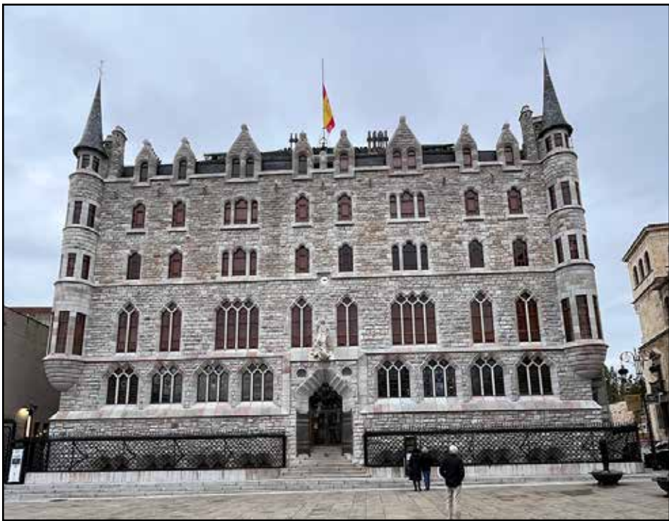
HOGWARTS COME TO LIFE: Casa Botines is an architectural marvel

A five-minute walk from the Cathedral lies one of Gaudí's masterpieces, Casa Botines . Built in little more than year in the early 1890s,