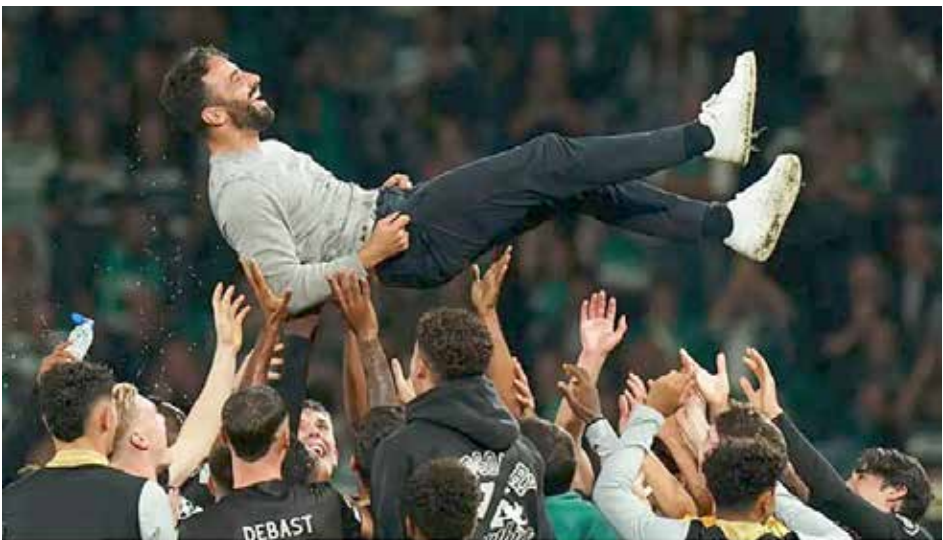
Amorim feels the love after Sporting beat Manchester City 4-1 on Tuesday

Nkunku is the club's top scorer this season with 10 goals - despite only starting one league game - which shows how distinct their cup team is.