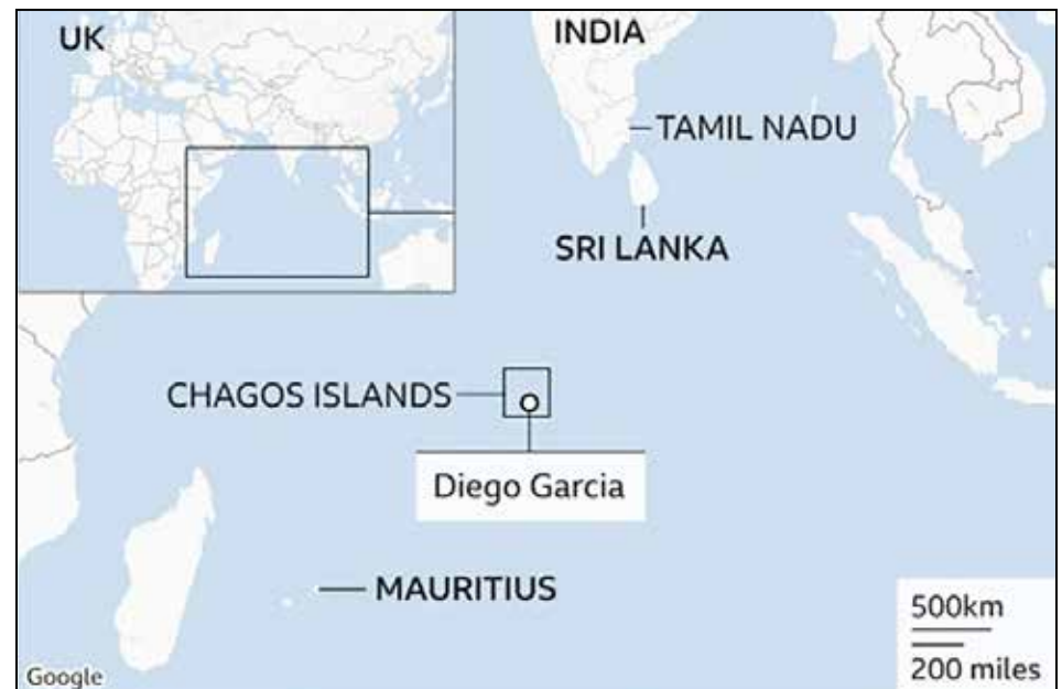
MILES FROM ANYWHERE: The Tamils landed on Diego Garcia three years ago

"Today's decision is an enormous relief to our clients and we urge the home secretary to close