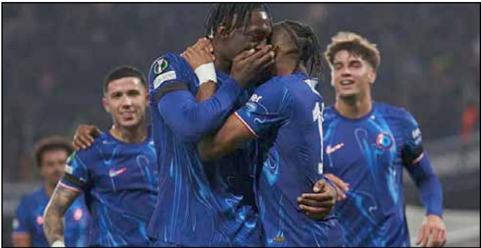
A ROMP AT THE BRIDGE: the Blues have scored 16 goals in their first three wins