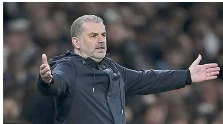
BIG HANDS: Postecoglou was frustrated (again) Thursday night

phy winners a route into the 2025-26 Champions League.