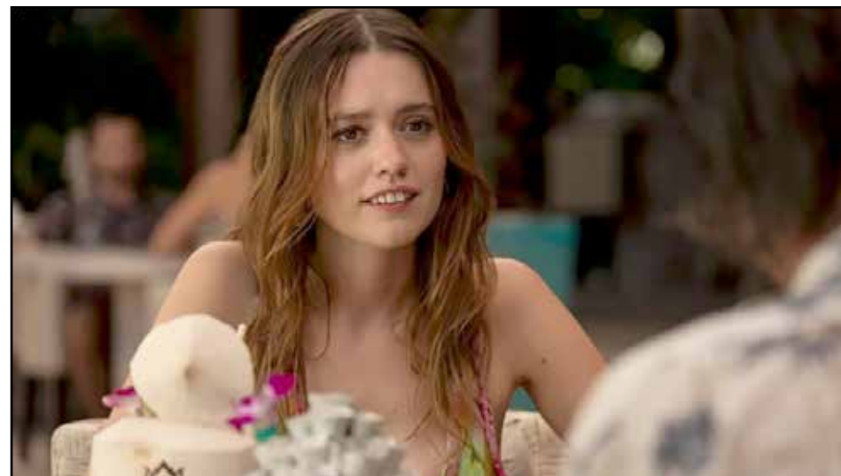
White Lotus creator Mike White reportedly fought hard against HBO to cast Aimee Lou Wood as Chelsea, the idealistic young resort guest

"It was honestly from the nicest place, but my little head goes: 'HBO didn't want me. And I know why HBO didn't want me, it's because I'm ugly. Mike had to