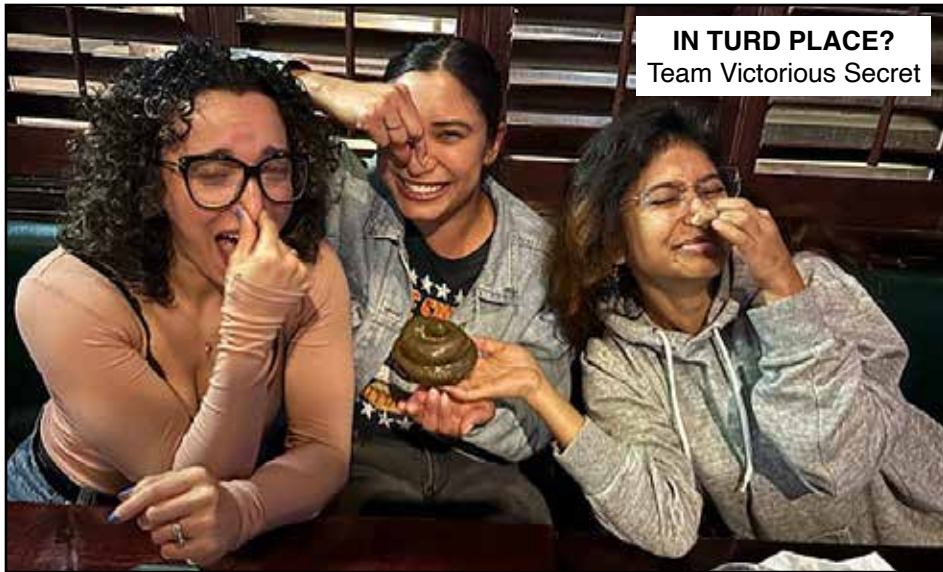
IN TURD PLACE? Team Victorious Secret

Finishing last at the latest Brits in LA Pub Quiz saw trivia team Victorious Secret (above) awarded a plastic poop trophy.