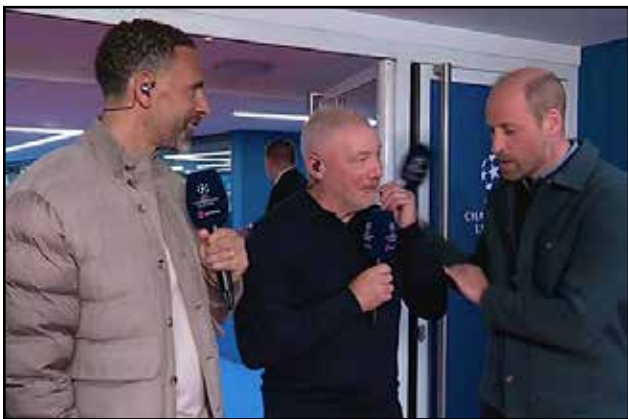
TALKING HEADS: Prince William's tactics chat with Rio Ferdinand and Ally McCoist was the talk of social media after the game

The prince was seen hugging some of Villa's players, including Marco Asensio and England international Marcus Rashford as