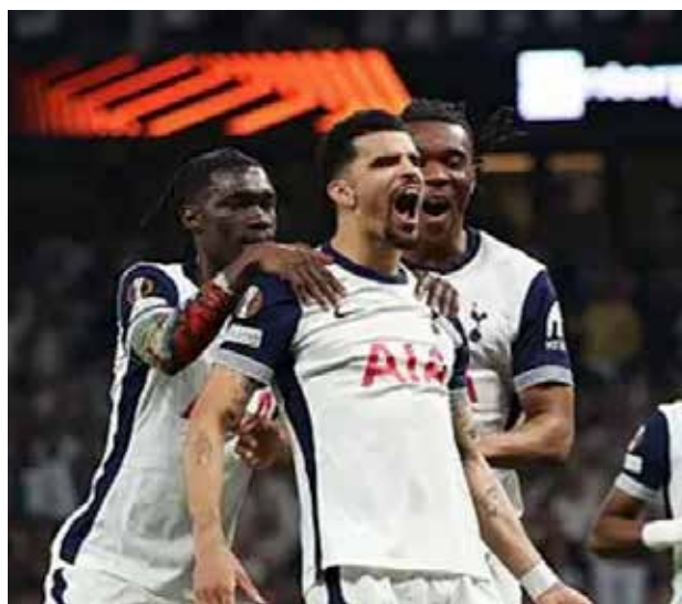
Dominic Solanke scored from the spot for Spurs