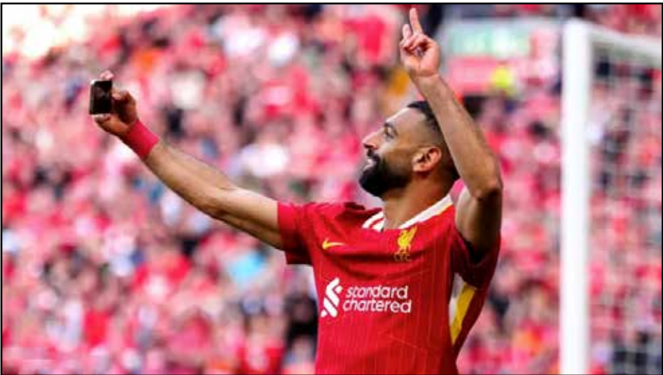
SELFIE MOMENT: Mo Salah celebrates scoring Liverpool's fourth goal on Sunday

The shock jolted Liverpool into action, the title was signed and sealed with three goals before the break that sent their expectant fans into ecstasy at the high point of Slot's spectacular first season in succession to