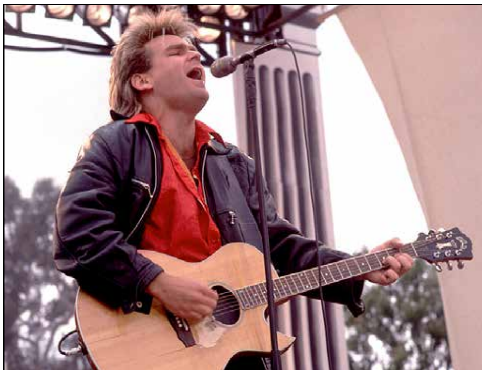
MIKE PETERS: "Everything was an inspiration for him to express his feelings through music"