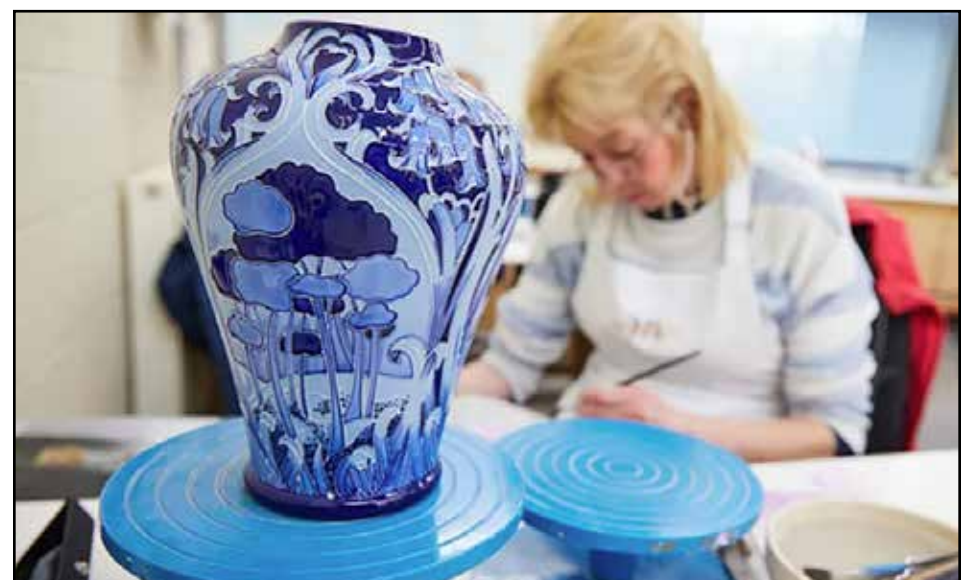
Moorcroft blame spiralling energy costs and cheap imports for their demise

The firm's collapse followed the closure of Dudson in 2019, Wade in Longton two years ago and Johnsons Tiles in 2024.