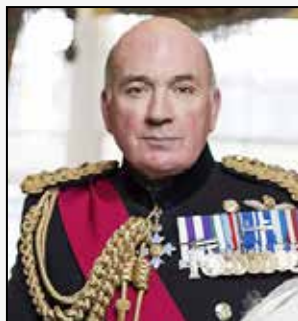
"With Russia's aggression continuing unabated we must remain totally focused on the threats we face."

He declared: "We have to remember the lessons of history. Back in the 1930s, we failed to either appease or deter Hitler, war broke