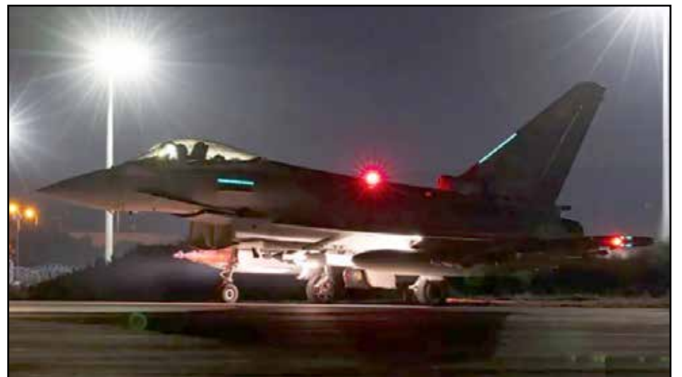
The RAF strike was conducted against a drone production facility

These are the first RAF air strikes on Houthi targets in Yemen approved by Sir Keir Starmer's government - and the first direct UK participation in US-led strikes since