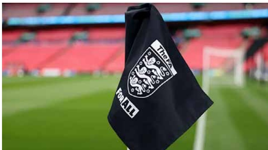
FINAL WHISTLE: there are no registered transgender women in the professional game

The FA has offered those players banned from competing free therapy with the Sporting Chance charity, which provides sportspeople with mental health support.