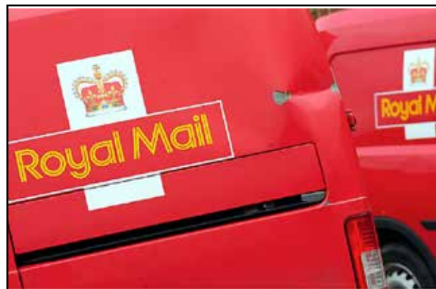
The Royal Mail was this week described as 'one of our country's most iconic and important companies.'

"Employees are at the centre of our plans for the business and we know we will only succeed with a clear, shared