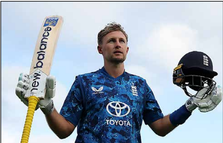
TAKING THE PLAUDITS: Joe Root celebrates his 100 at Cardiff this week