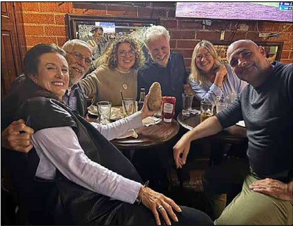
Getting Mashed: The Pickles won a consolation potato