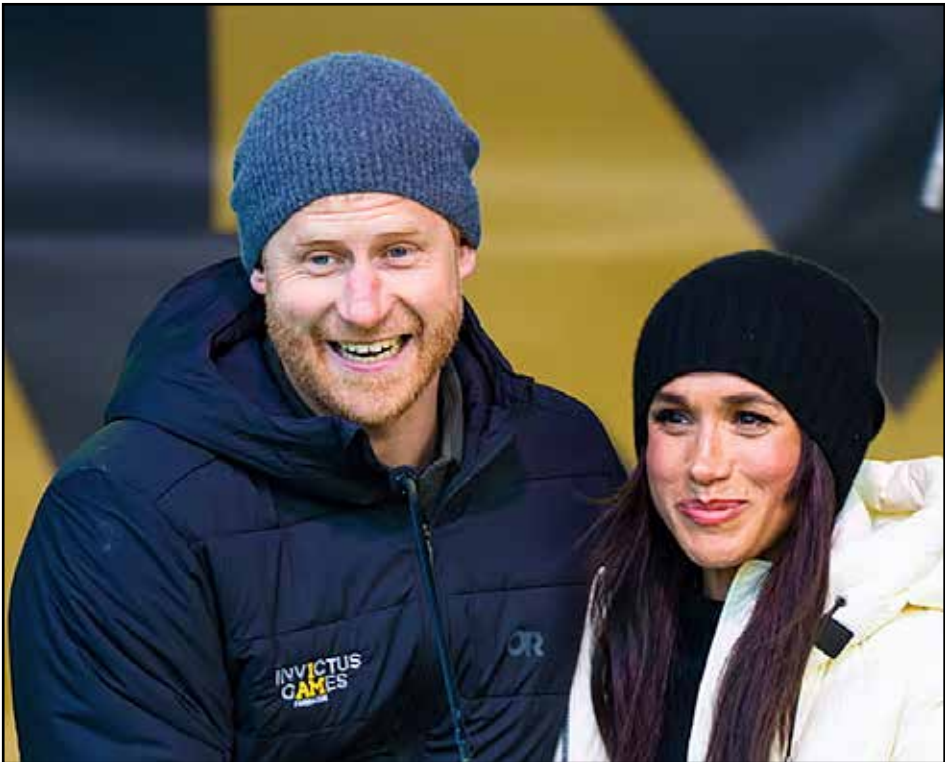
The latest claim of mistreatment from the Sussexes is unlikely to help Harry’s stated aim of seeking a reconciliation with the rest of the royal family

The Duke and Duchess of Sussex explored the idea of changing their family name to Spencer amid repeated delays by British officials to issue passports for their children, according to reports. The suggestion was a result of “sheer exasperation” and came during a face-to-face meeting between Prince Harry and his uncle Earl Spencer. He was understood to be enthusiastic and supportive of the name change. Adopting the birth name of his mother, Diana, would probably have further deepened the rift between the Harry and the royal family, which shows no signs of being healed. legal threats However, the discussion became moot because the UK passports for Prince Archie and Princess Lilibet were finally issued almost six months after the initial applications – days after lawyers for the Sussexes sent a letter threatening to pursue a data subject access request. This could have revealed details of the delays – and the nature of any behind-the-scenes discussions between British officials responsible for issuing the documents. One source claimed that the duke and duchess had feared that UK officials were dragging their feet because the passport applications included the titles HRH (His/Her Royal Highness) for both children. The applications also used the surname Sussex, which the family had already started using publicly; until 2023, Archie had