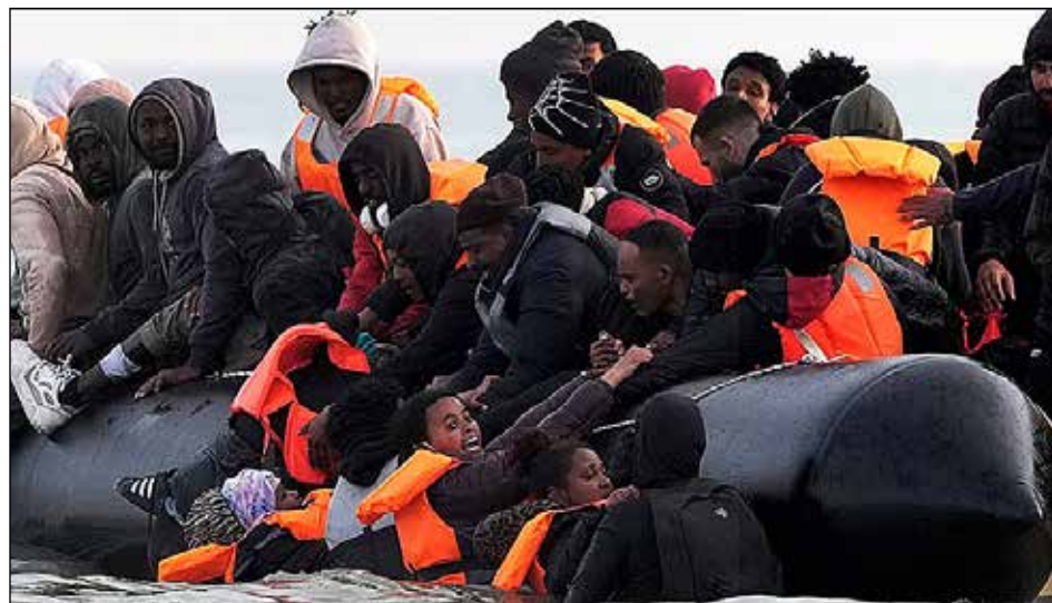
A record 1,195 people reached the UK in 19 small boats on Saturday

It was reported that French officials stopped fewer than 200 people from making the journey, but Home Office sources said French au-