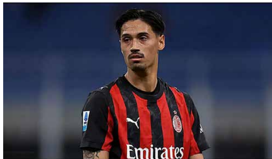
Tijjani Reijnders joined AC Milan in 2023 from AZ Alkmaar

goalscoring season of Reijnders' career, with the 26-year-old hitting double digits for the first time.