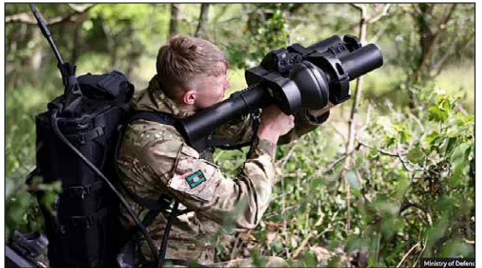
Ten times more lethal? That is what John Healey promised this week

"Our adversaries are working more in alliance with one another, while technology is changing