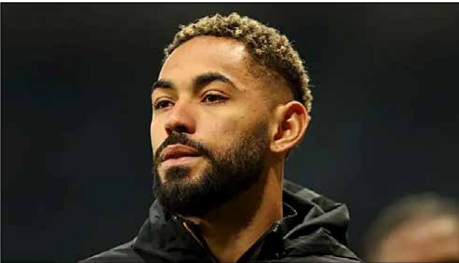
Matheus Cunha scored 31 goals in 76 appearances for Wolves

He joined the club in a £35m deal from Atletico