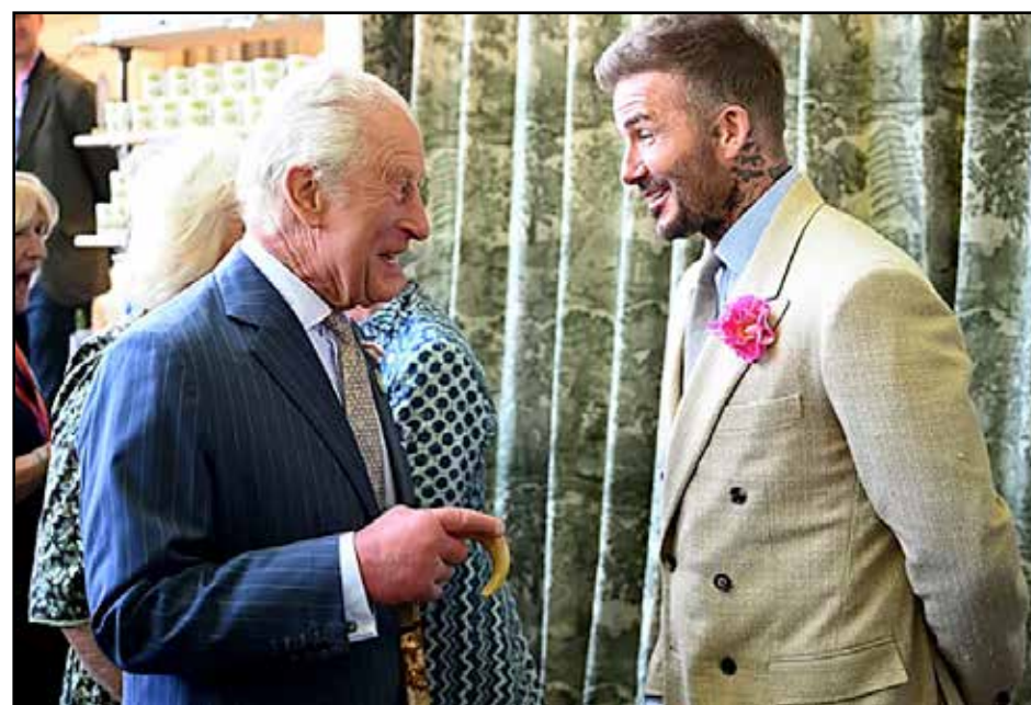
NOW WE'RE BOTH POSH: King Charles and David Beckham share a moment at last month's Chelsea Flower Show in London

ity ambassador by the King, and beekeeper Becks was buzzing with excitement at teaming up with him.