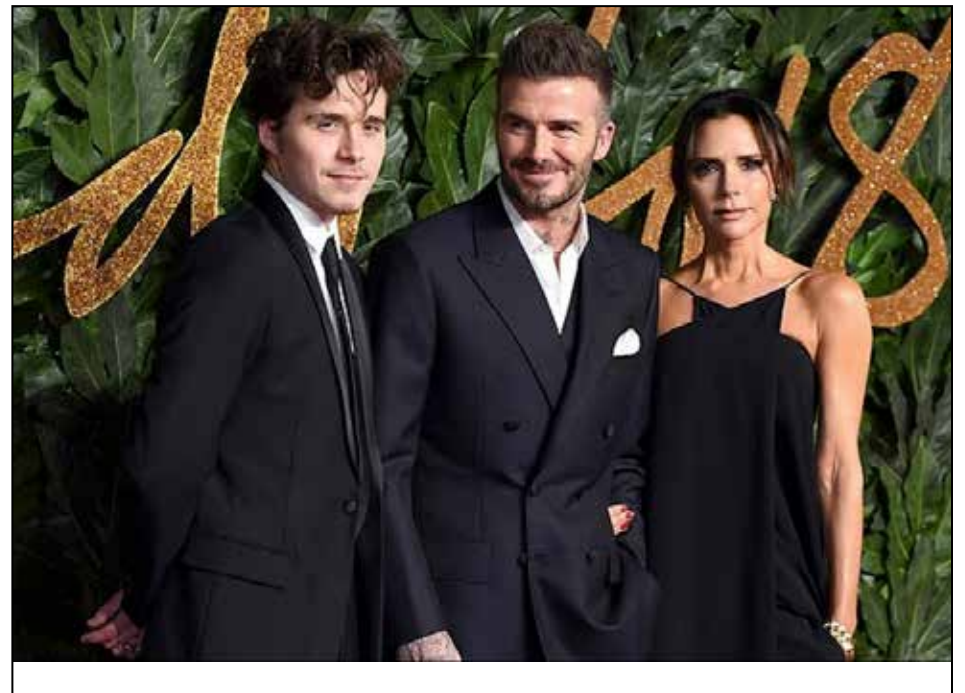
No More Happy Families: Brooklyn with father David and Mum Victoria

one involved, especially David and Victoria who love him very much. This isn’t the Brooklyn his family knows and loves.