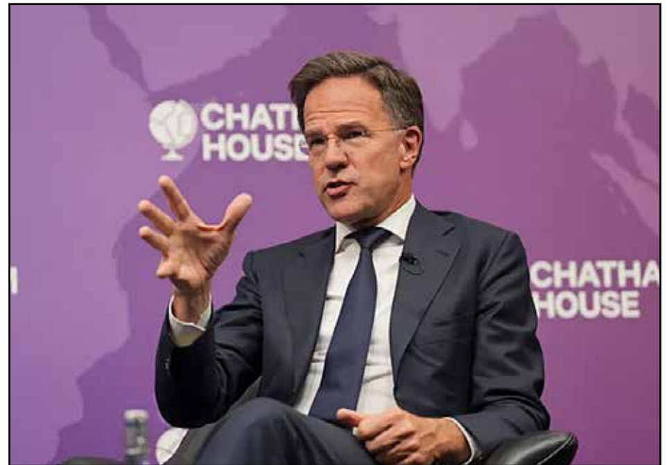
SOBERING ASSESSMENT: Rutte said Nato budgets need to rise to 5% of GDP

up to me to decide, of course, how countries pay the bill."