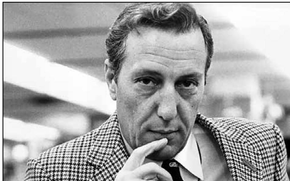
FORSYTH: he was the most professional writer an editor could hope for."

"After serving as one of the youngest ever RAF pilots, he turned to journalism, using his gift for languages in German, French and Russian to become a foreign correspondent in Biafra.