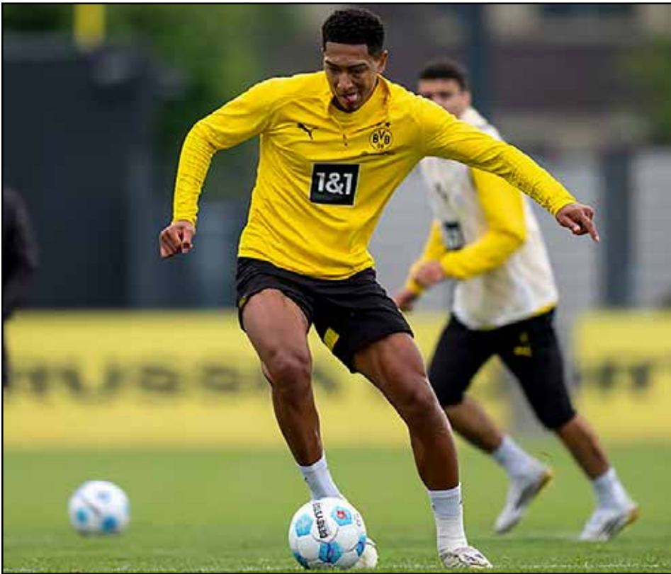
Jobe's a good 'un? Borussia Dortmund are betting £32m he will be

Yet just as Welsh fans were dreaming of another famous result against the nation they so memorably beat in a Euro 2016 quarter-final De Bruyne popped up at the back post to score.