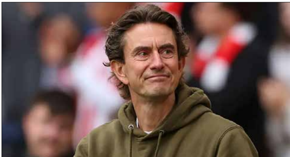
POISONED CHALICE? Thomas Frank will know soon enough....

Tottenham have appointed Brentford boss Thomas Frank as their head coach on a deal until 2028.