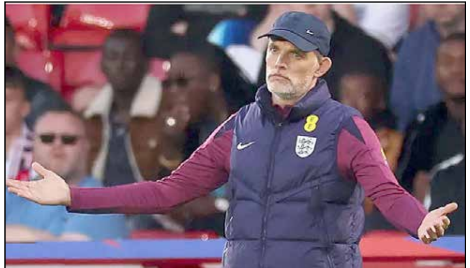
DOUBTING THOMAS: The England manager cut a frustrated figure on Tuesday

England had the perfect start with Kane's goal, and while this game came at the end of a gruelling season, it was still a chastening experience to see Tuchel's team so comprehensively outplayed.