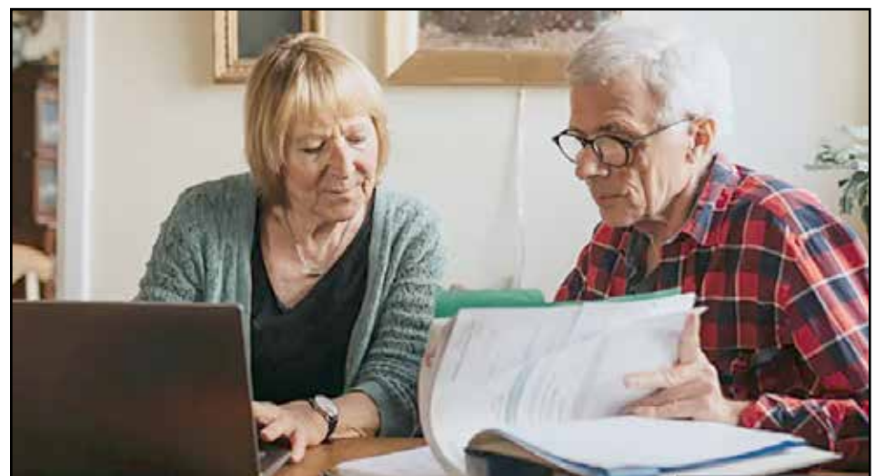
Millions of pensioners were facing a 'heat or eat' decision next winter

More than three-quarters of pensioners will receive the winter fuel payment this year after Chancellor Rachel Reeves confirmed a major policy U-turn.