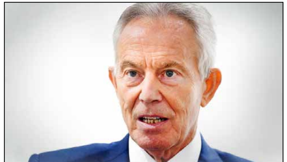
The former Prime Minister served as Middle East envoy after leaving office

In early August, Israel announced plans to occupy the whole Gaza Strip - including Gaza City, which it described as