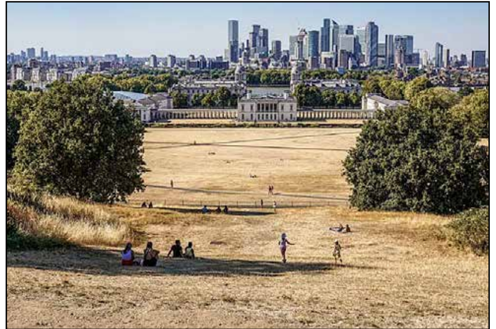
PARCHED CAPITAL: the view from London's Greenwich Park this week

Scientists have warned that temperature extremes in the UK are becoming "the norm". The UK climate has been warming at a rate of approximately 0.25C per decade since the 1980s. The last three years are also among the country's five warmest on record.