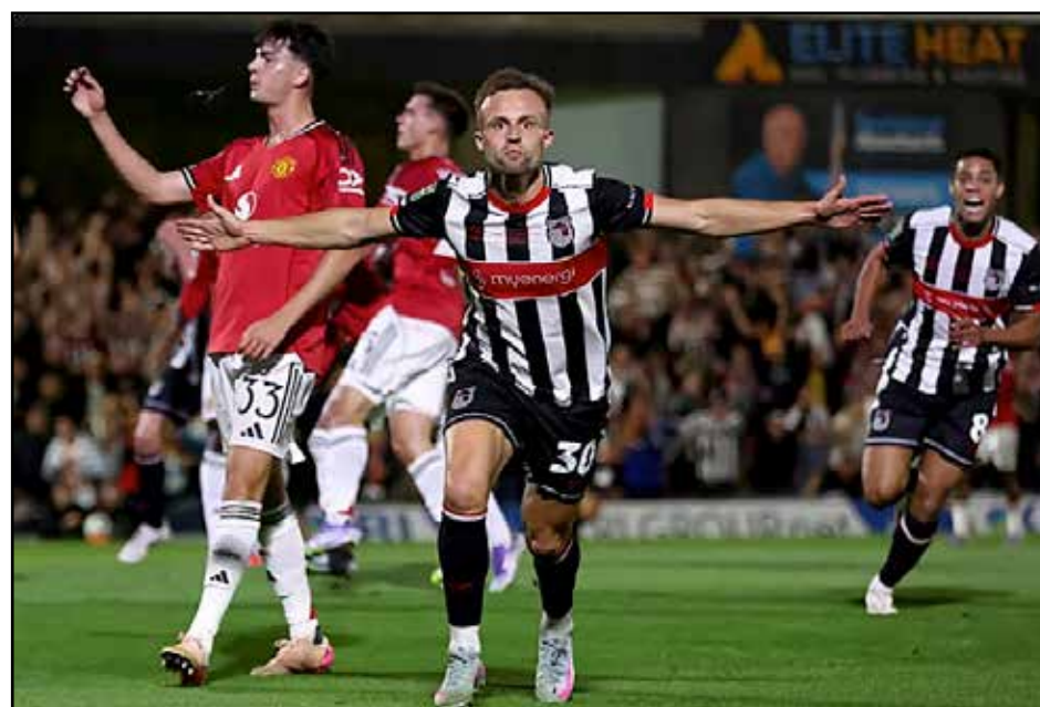
It was a night Grimsby will never forget...

United battled back through Mbeumo with 15 minutes left and Har-