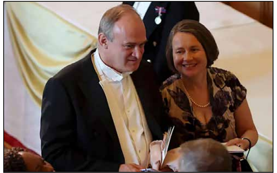
Sir Ed Davey and his wife attended last month's state dinner for President Macron

quet is the one way I can send a message to Donald Trump and Keir Starmer that they can't close their eyes and wish this away. We have to speak up, they have to act. Donald Trump must act to end this humanitarian crisis."