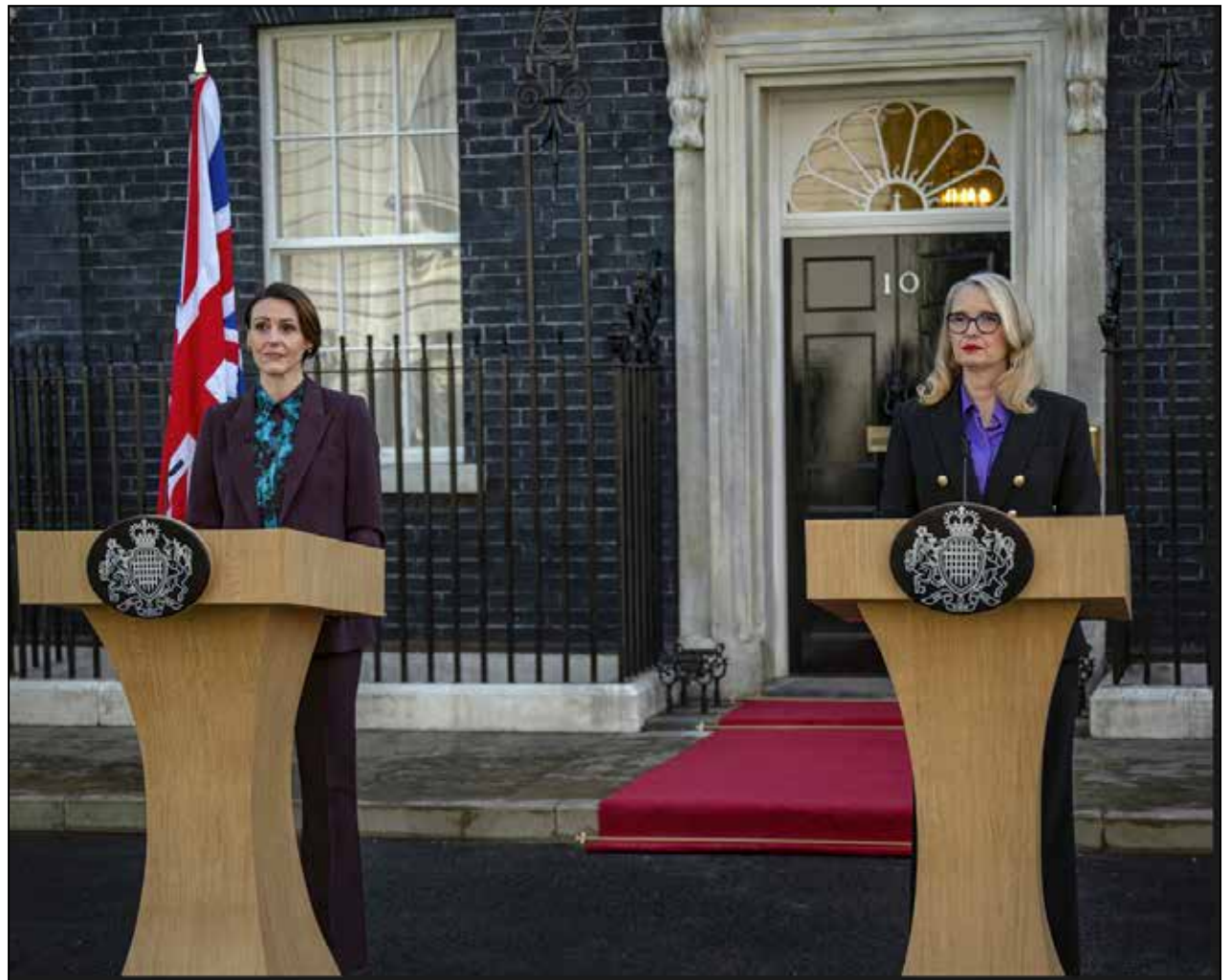
BEST OF ENEMIES: Suranne Jones and Julie Delpy as the British Prime Minister and the French President initially lock horns...until a rising body count forces them to abandon traditional rivalries