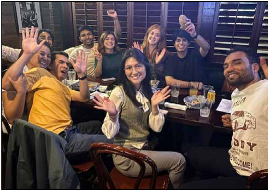
Triumphant trivia team The Quizardry (pictured, top) won the latest Brits in LA Pub Quiz, pipping Putin's Poodle to the title.

Booze Clues and Quiz Face (above) picked up consolation prizes at the popular Tuesday night contest at O'Briens in Santa Monica.