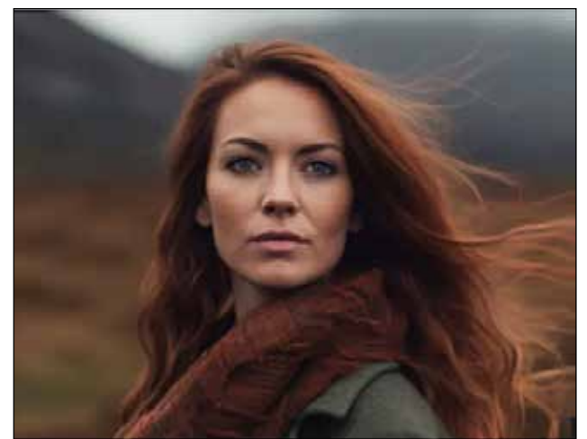
The marketing department's image of 'Iona', the AI generated voice of ScotRail's public announcements

"As artificial intelligence continues to