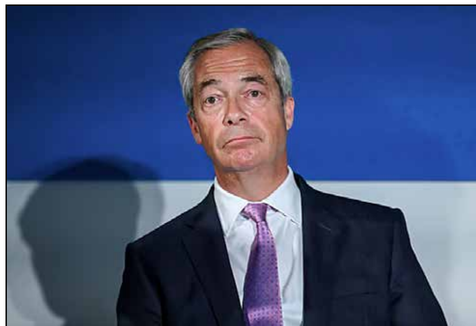
"It's an invasion," said Nigel Farage of Britain's migrant issue this week

Much of the political focus has centered on record numbers of people arriving across the Channel in small boats. Reform claims there are one million people in the UK illegally and says it would deport