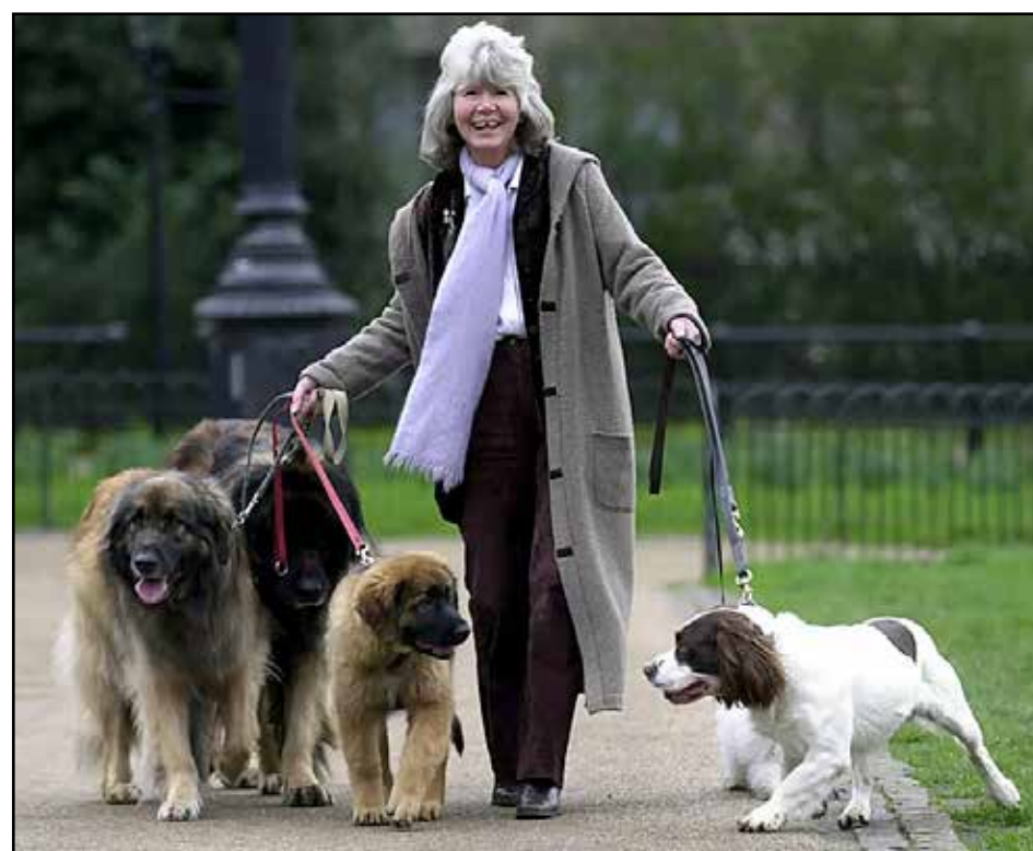
QUEEN OF THE BONKBUSTER: Jilly Cooper’s bawdy tales of upper crust English rural life sold 11m copies and launched a new literary genre

Several romantic novels followed, all given the