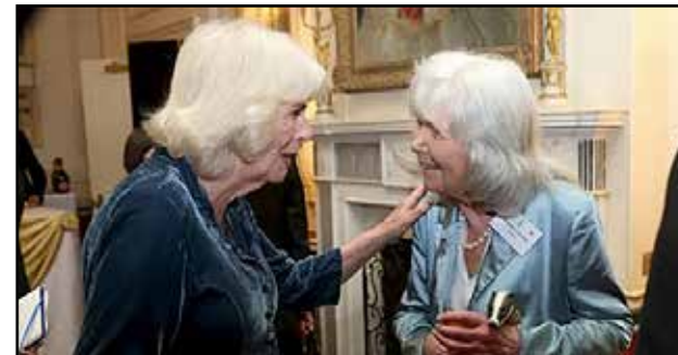
Camilla (left) described Cooper as: “a wonderfully witty and compassionate friend to me and so many..”

For 40 years, Jilly Cooper chronicled the comings and goings – largely the comings – of the rampant Rutshire gentry. It is a land of rotters such as Campbell-Black, and those who lust after them. She wrote with equal enthusiasm about the formidable sort of women who know how to wring a pheasant’s neck. “The male is a domestic animal,” she wrote, “which, if treated with firmness,