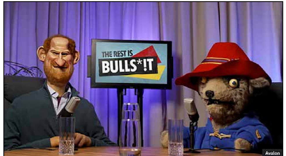
NOW ON YOUTUBE: 'Prince Harry' and 'Paddington' host the podcast

The Bafta and Emmy award-winning television series originally ran for 18 series between 1984 and 1996, returning