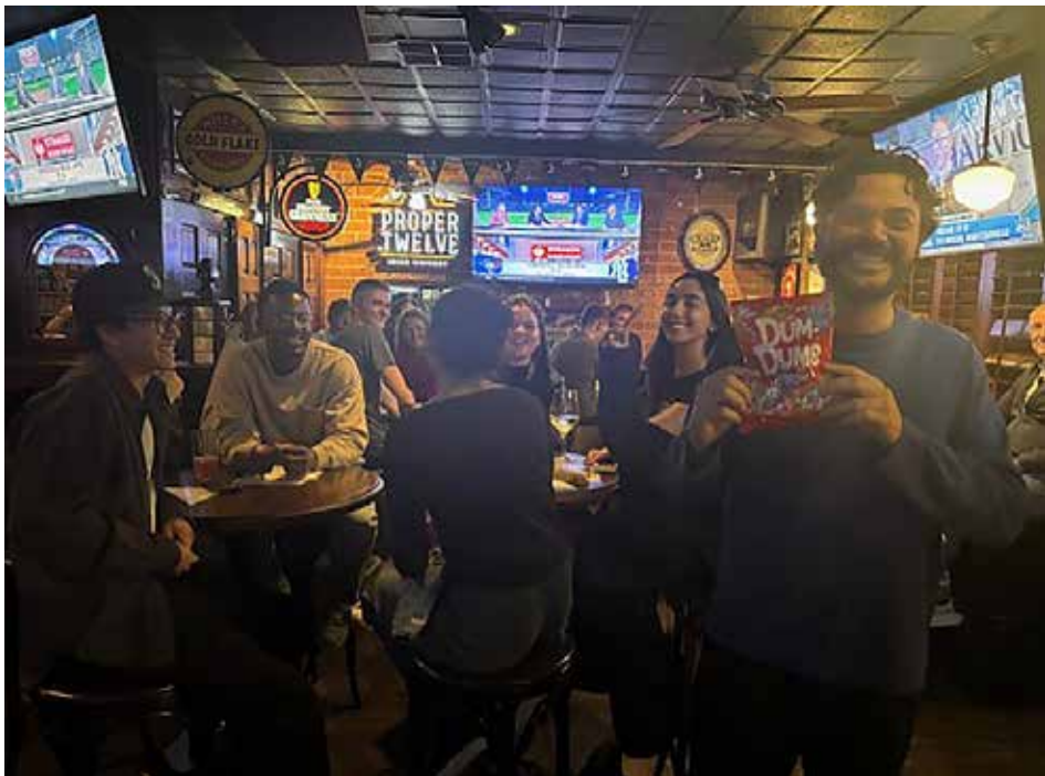
HAVING A BLINDER: The Newbies (top) celebrate their win while (above) last place Dum Dum winners Team Albania were just happy to take part...