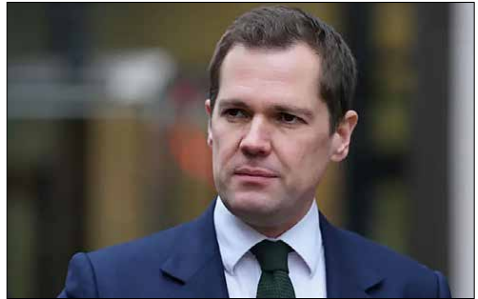
JENRICK: his comments come as his party struggles to outflank Reform on immigration

The chair of the Labour Party, Anna Turley, argued the initial remarks reduced people “to the