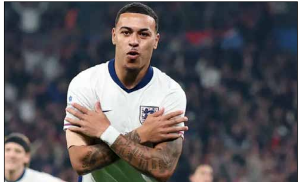
Morgan Rogers scored a goal and impressed again in an England shirt

He scored the opener, his first for England, had a