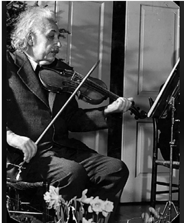
Einstein first picked up a violin at age four and played the instrument for the rest of his life