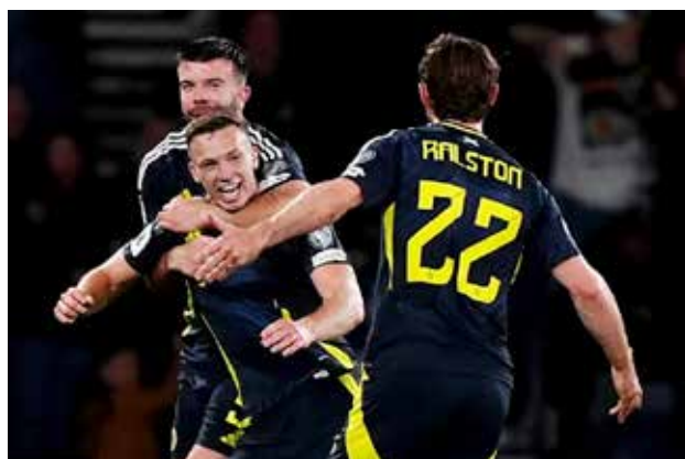
Three second half goals stunned the previously dominant Greek visitors at Hampden on Thursday

There were loud boos from the Tartan Army, but Ryan Christie quickly equalised in the aftermath of a corner - an effort which survived a lengthy VAR check - to