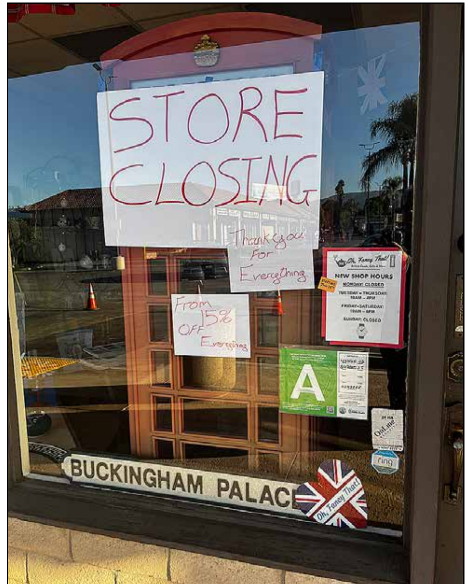
THE END OF AN ERA: the window of the Reseda store announcing the news