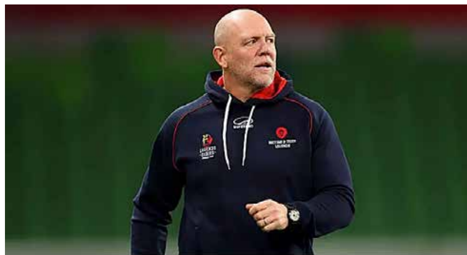
Former England centre and 2003 Rugby World Cup winner Mike Tindall is fronting the R360 project, which is planning to launch in October 2026

Rugby's leading nations have united to announce a blanket ban on playing international matches for recruits to a new proposed breakaway league.