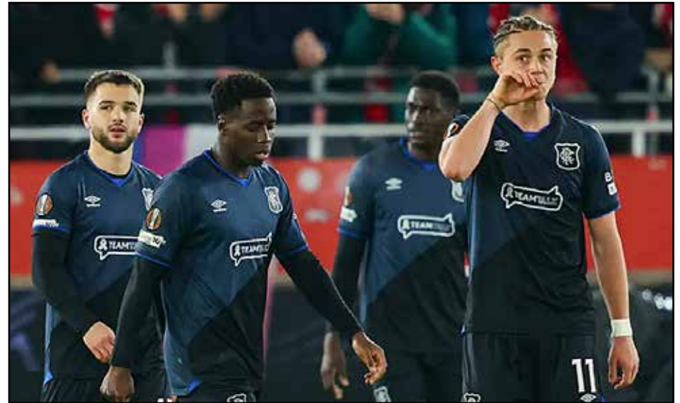
DESPONDENT: Rangers' heads went down after the second Brann goal

"From the get-go, he was really taking a lot of responsibility at both Leipzig and Southamp-