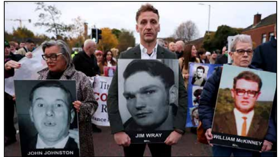
NOT FORGOTTEN: relatives of the deceased men carried their images to the court

He said the Bloody Sunday families and all families who lost relatives in the Troubles, "continue to experi-