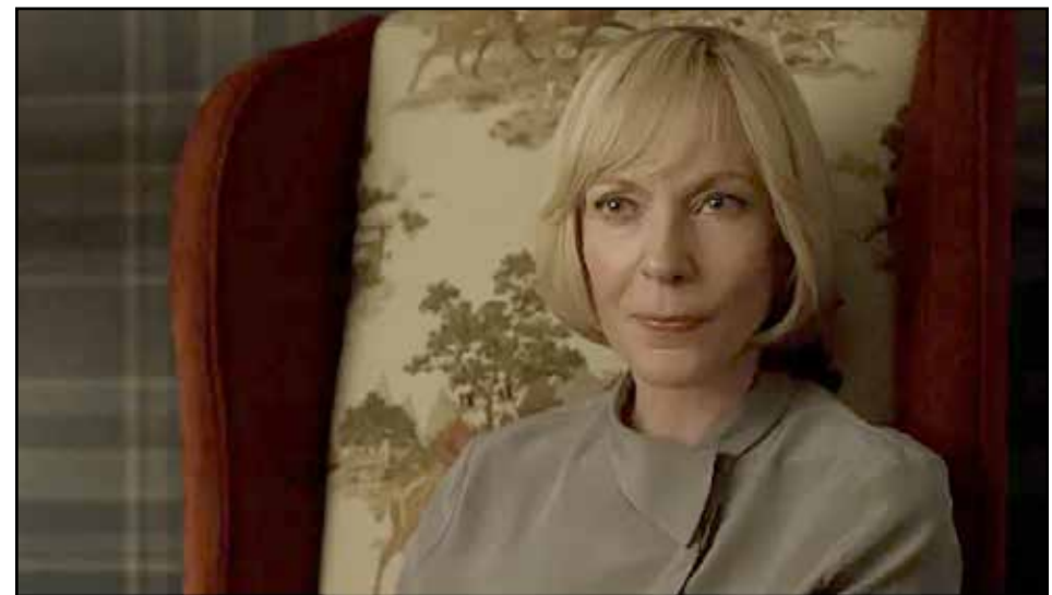
PENN AND INK: Allison Janney as Grace Penn, a 'terribly flawed woman'