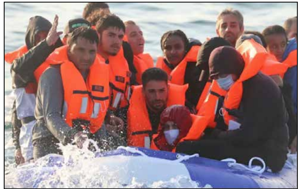
GREAT EXPECTATIONS: the flow of migrants on small boats across the English Channel is a dickens of a problem for British politicians

A senior British Army intelligence officer, speaking on background, briefed several news organizations about the threat during the summer, saying: “Make no mistake, this migrant crisis has Russian fingerprints all over it...from the expensive RIBS (dinghies) to the powerful outboards, to the communications network, to the trans-continental coordination of migrant flows, this is far more than a few well organized gangs. Without doubt these are the actions of a hostile state actor.”