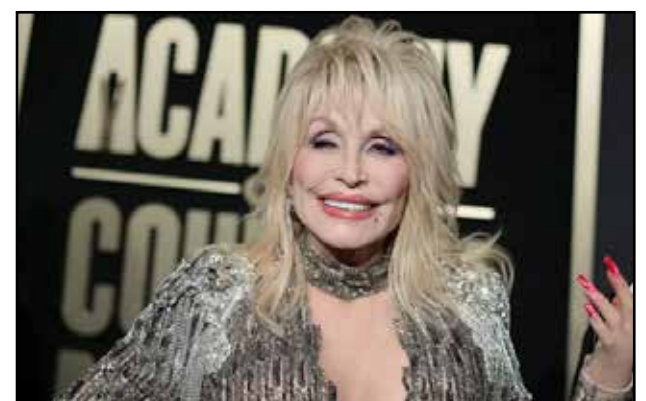
Parton will provide 60 books each for 75 babies

The DUP councillor said she would like to