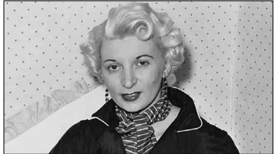
KILLER AND VICTIM: Nightclub hostess Ruth Ellis was executed for the murder of her abusive lover David Blakely in July 1955

"She is a murderer but she didn't deserve to be taken from the world in the way that she was,"