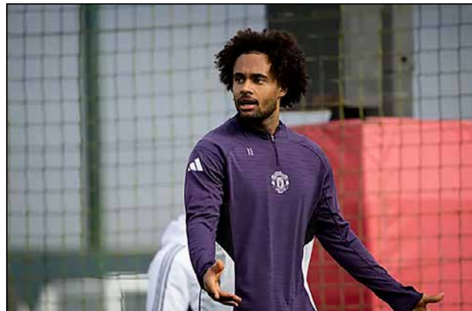
Zirkzee impressed for Bologna in Serie A before his 2024 move to United

Zirkzee attracted much criticism during a difficult campaign, with some pundits instant-