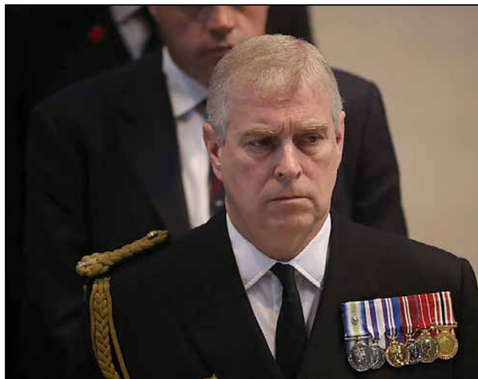
DENIAL: the Prince has consistently denied Ms. Giuffre's allegations

But there are still calls for them to be formally removed.