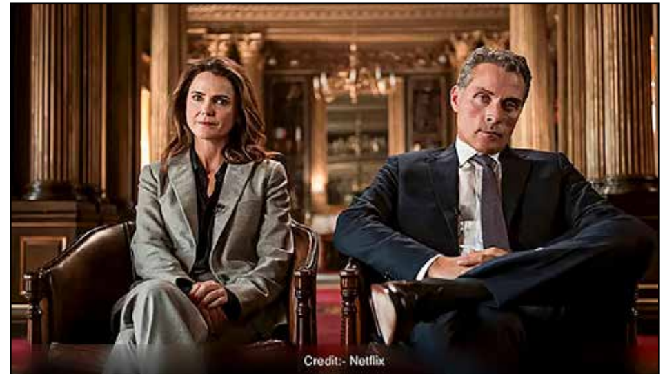
KATE AND HAL: his elevation to vice president tests their relationship

Verdict: 8/10 — gloriously mad, wildly entertaining and impossible to switch off.