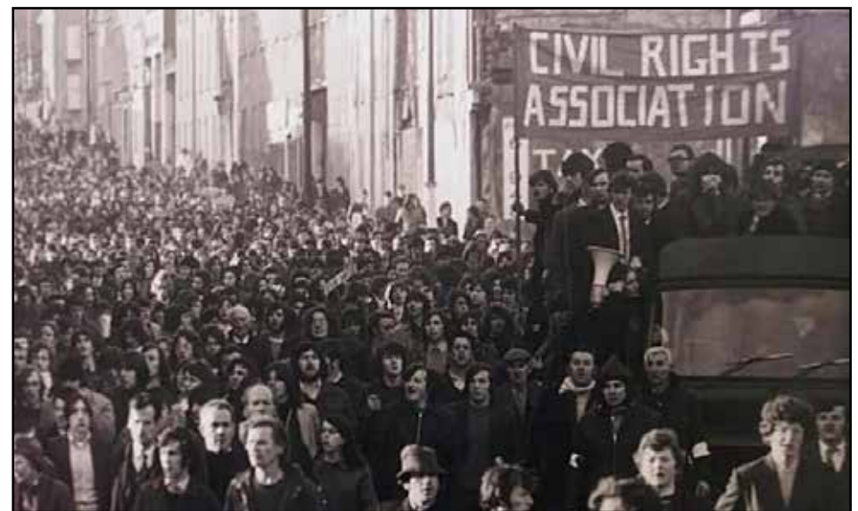
January 30 1972: Thirteen demonstrators were shot dead on Bloody Sunday

ence pain", adding "we should not forget that today".