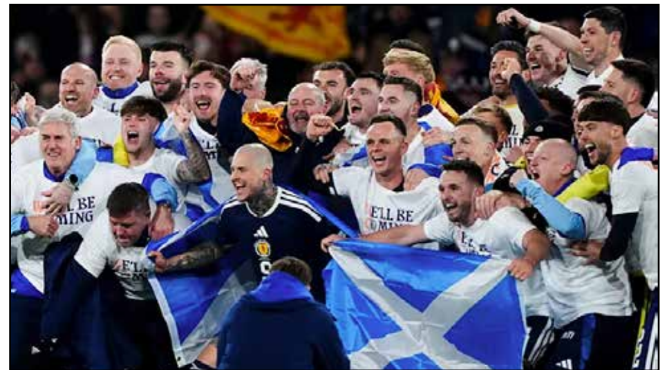
JOY UNCONFINED: Players and staff celebrate their 4-2 win over Denmark

They faced Greece again at the weekend in a match they thought they had to win or draw to retain hopes of automatic World Cup quali-