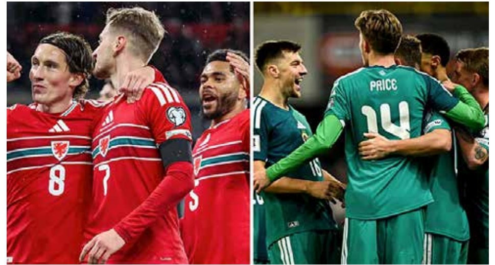
IN CONTENTION: Wales secured their World Cup playoff spot with their 7-1 demolition of North Macedonia this week, while Northern Ireland are in courtesy of their performance in last year's Nations League

Twelve teams entered the play-offs by finishing second in their World Cup qualifying group. Four teams, including Northern Ireland, qual-