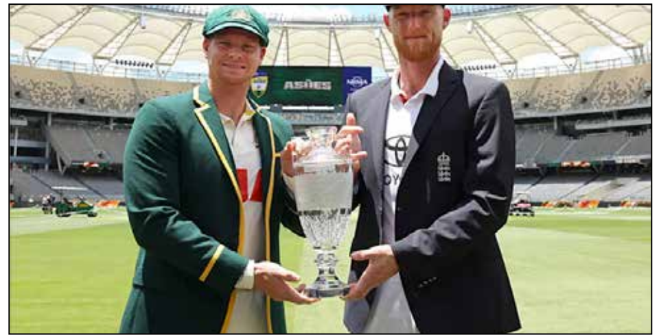
SMITH AND STOKES: England have not won an Ashes series since the 2015 triumph on home soil - and the hosts are predicting another Aussie win

Brydon Carse and Stokes can all touch 90mph.