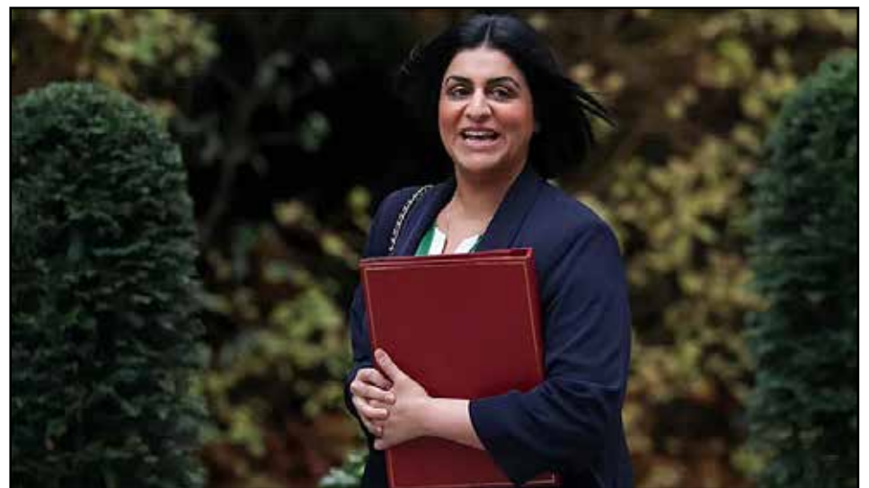
Mahmood: staying in UK is “not a right but a privilege - and one that must be earned”.

People who arrived on post-Brexit health and social care visas would