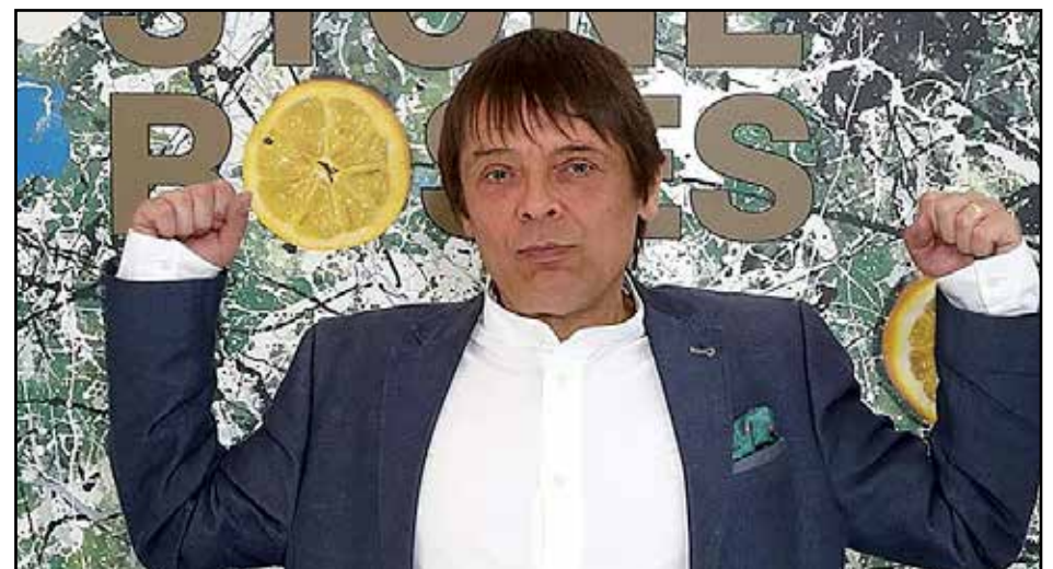
Gary 'Mani' Mounfield also played on both Stone Roses albums and later joined Primal Scream

drums, the Stone Roses were at the forefront of the "Madchester" indie scene of the late 1980s and early 90s.