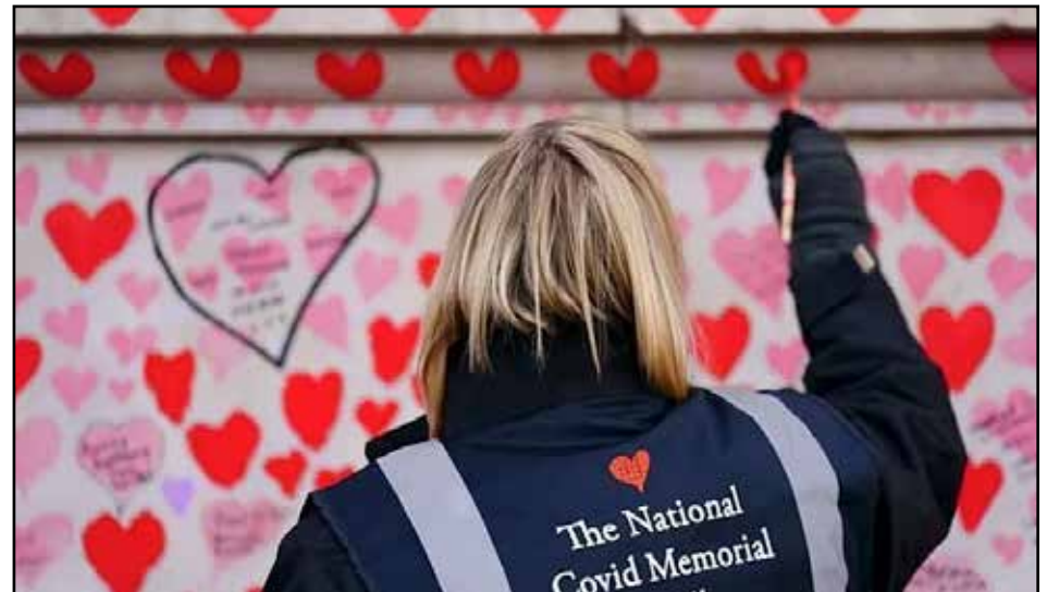
HEAVY TOLL: up to 23,000 lives were lost unnecessarily said the report

Rule-breaking by politicians and their advisers - Dominic Cummings’ trip to Durham and Barnard Castle in March 2020 was listed - undermined public confidence in decision-making and significantly increased the risk of people not sticking to