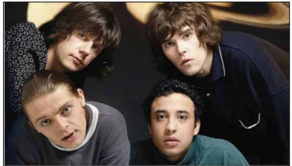
AT THEIR ZENITH: Mani, bottom left, with John Squire, Ian Brown and Remi shortly after the release of their landmark 1989 album

With Mani on bass, Brown on vocals, John Squire on guitar and Alan "Reni" Wren on