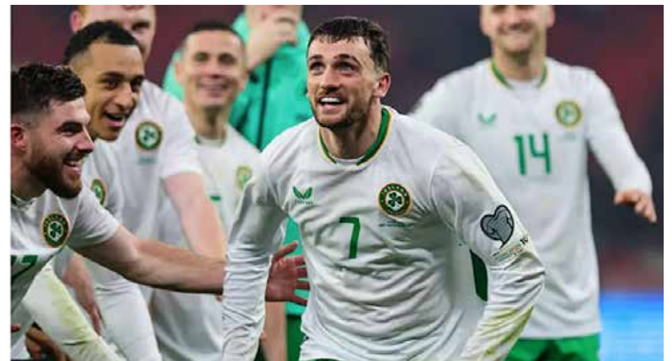
GREEN AS A PARROTT: The striker has scored five goals in two games

After picking up just one point from the first three games - a loss to Armenia unquestionably the low-point - the