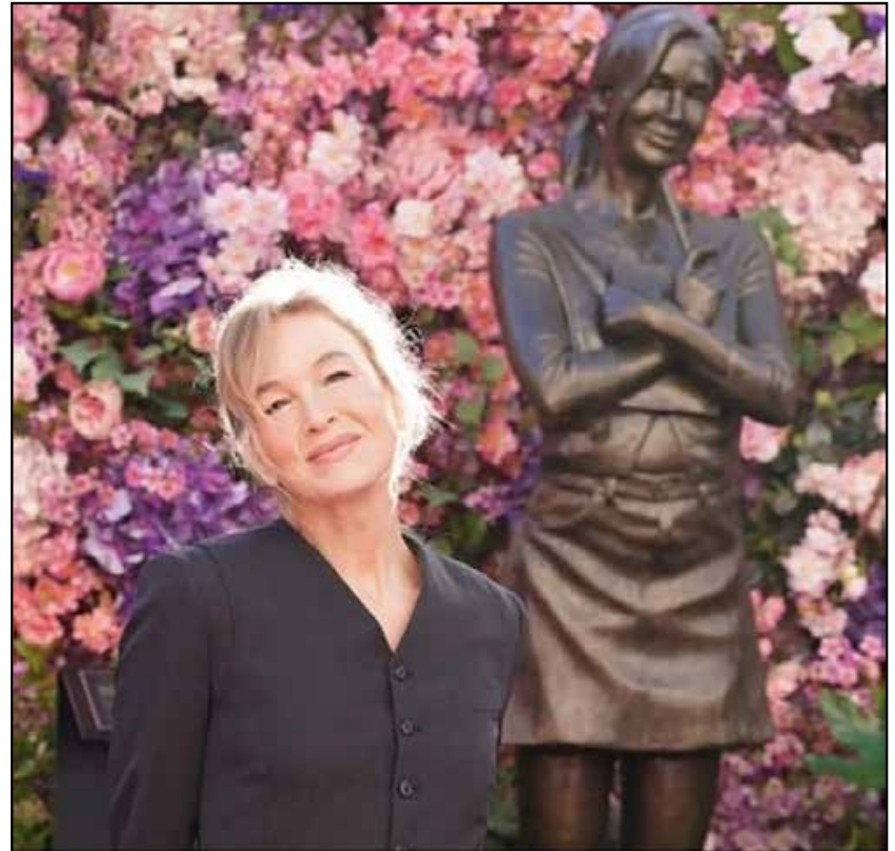
PART OF A LIFETIME: Renée Zellweger and her alter ego

"Bridget Jones's Diary couldn't be written