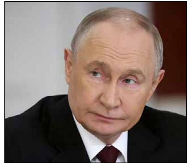
Putin will not stop at Ukraine, claims Lord Robertson

“We have to face the fact that Vladimir Putin’s territorial ambitions are not restricted to eastern Ukraine.”