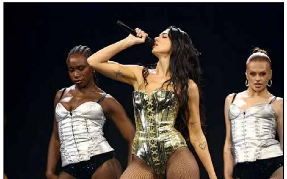
NAKED CAPITALISM: Dua Lipa was among the artists who has called for the government to end the ‘fleecing of music fans’ by ticket touts

The modelling which shows 23,000 deaths could have been saved by locking down a week earlier than 23 March 2020 was produced in 2021. The figure would have equated to 48% fewer deaths in the first wave to 1 July 2020.