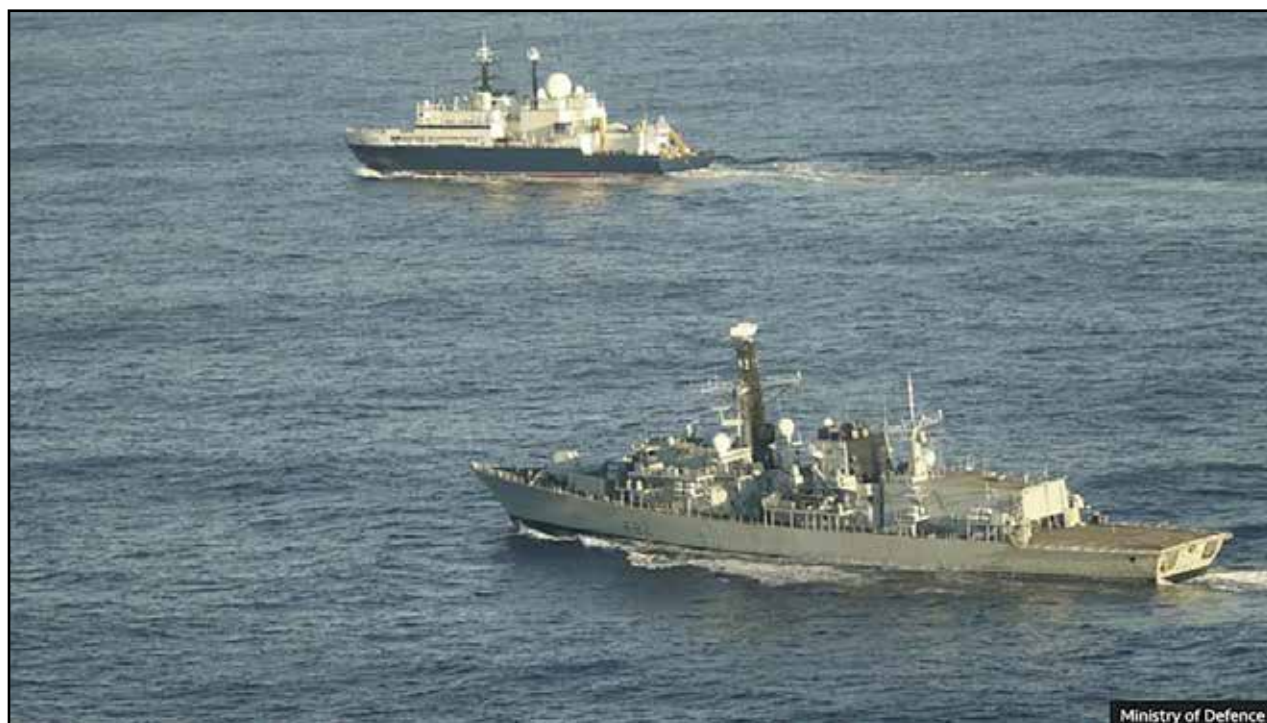
SHADOW BOXING: HMS Somerset monitoring the Yantar near UK waters this week

Asked about the risks posed by lasers, Healey replied: "Anything that impedes, disrupts or puts at risk pilots in charge of British military planes is deeply