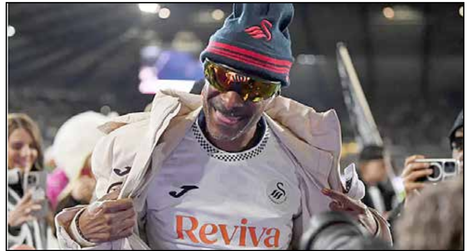
IT'S THAT MAN AGAIN: Snoop's been everywhere this month

loudest during a first half in which their team led to puncture the party atmosphere.