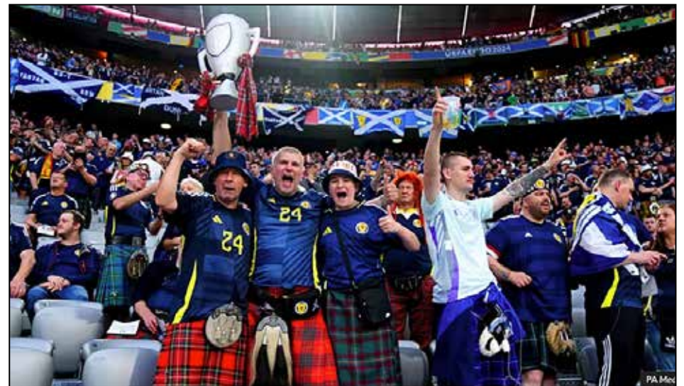
THAT'S NAE MAN-PURSE: Scottish fans can see their team compete in Massachusetts and Florida this summer...while wearing their sporrans

He said he never had any doubts that Scotland fans would be allowed to wear their sporrans in the