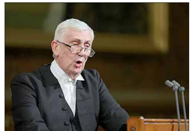
MUST HE GO? Speaker Sir Lindsay Hoyle

The session began with a rare “Speaker’s Statement,” delivered by a visibly-strained Hoyle. He confirmed to a hushed House that he had personally contacted the Metropolitan Police with a tip that Mandelson