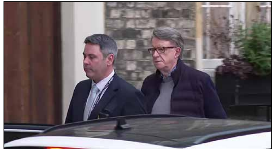
Lord Mandelson was arrested at his London home on Monday

As Mandelson remains on bail, the broader implications for the British establishment are staggering. Coming so closely on