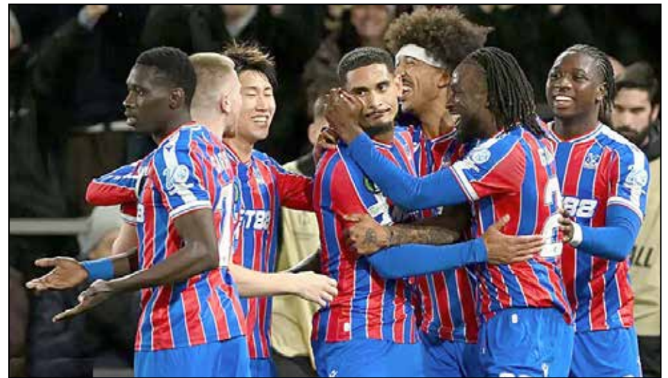
Crystal Palace has had their share of problems in the EPL this season...but they have taken to European football like the proverbial ducks to water

cup final, joined Arsenal and captain Marc Guehi almost moved to Liverpool, only for the deal to fall apart as the Eagles could not sort out a replacement.