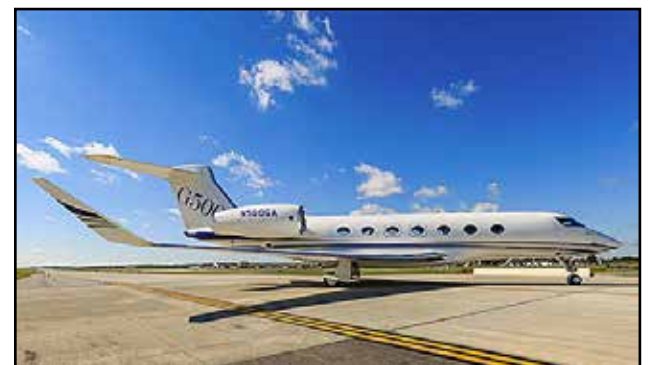
THE LOLITA EXPRESS: an investigation has established that around 90 flights linked to Epstein arrived and departed from UK airports

Stansted Airport said in a statement that the