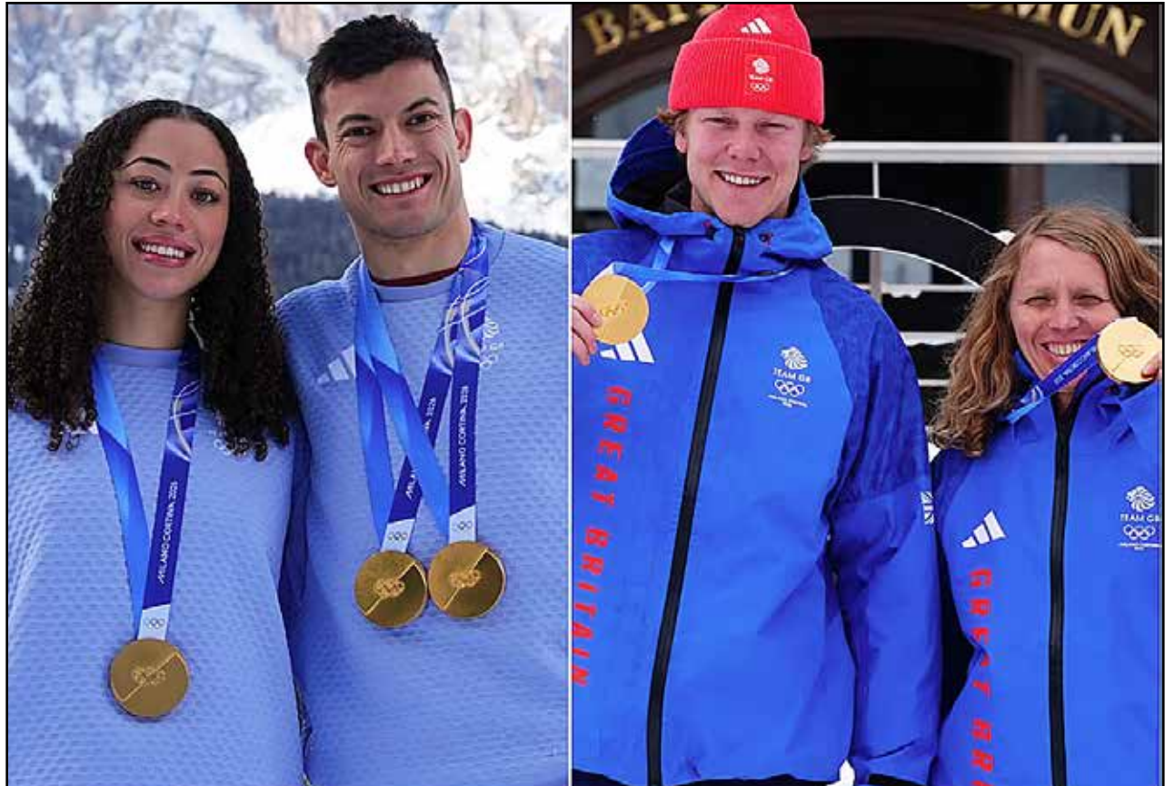
FAB FOUR: Tabby Stoeker and Matt Weston, Huw Nightingale and Charlotte Bankes (left to right) contributed to Britain's best-ever Winter Olympics at Milan-Cortina this month