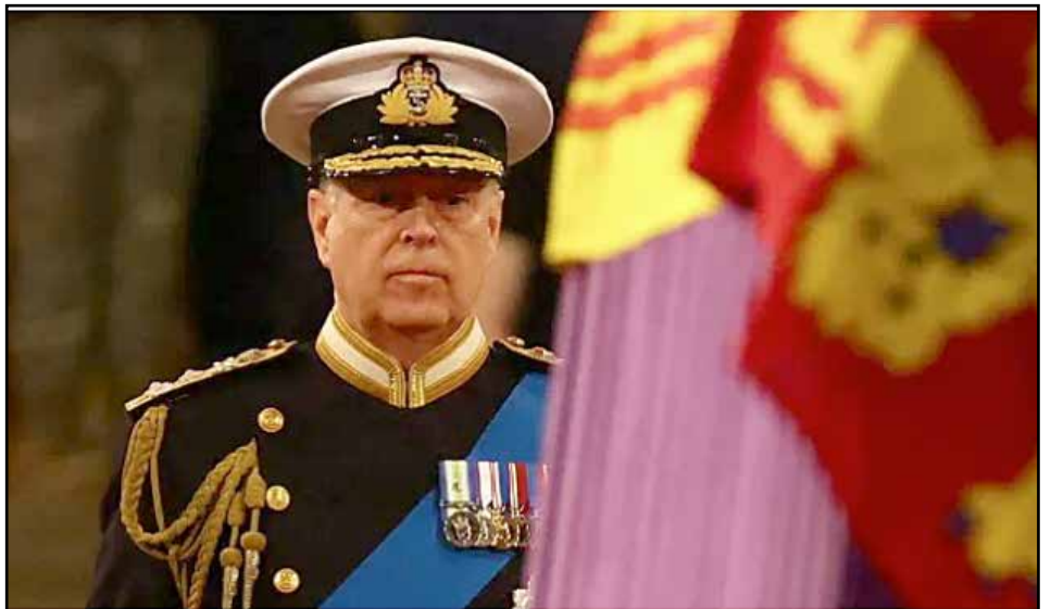
THE WAGES OF SIN: Andrew pictured the last time he was permitted to wear his uniform in public, at the funeral of his late mother the Queen

Though Andrew was stripped of his "His Royal Highness" (HRH) status and the title of "Prince" in late 2025, he remained in the line of succession - a technicality that many now find untenable. By removing him, the Commonwealth realms hope