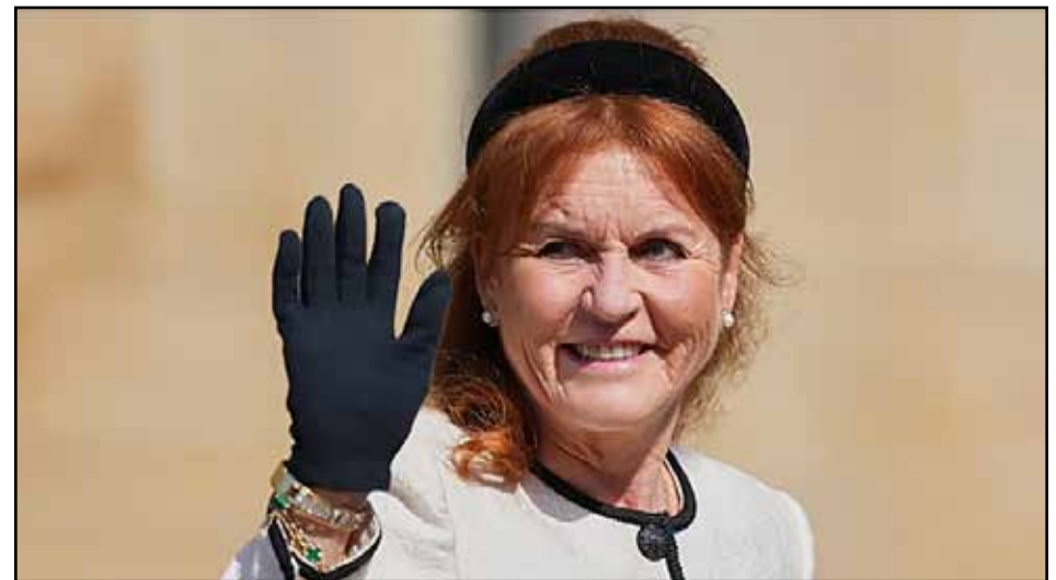
As a non-US citizen, Ferguson, 66, is not compelled to appear before Congress

After her divorce from the then Prince, Ferguson turned to the States as both a commercial base