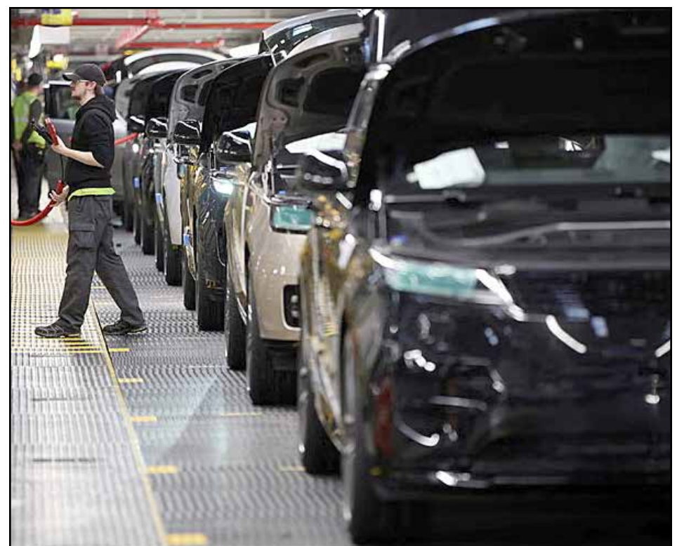
STILL HUMMING: JLR is Britain's largest automotive employer