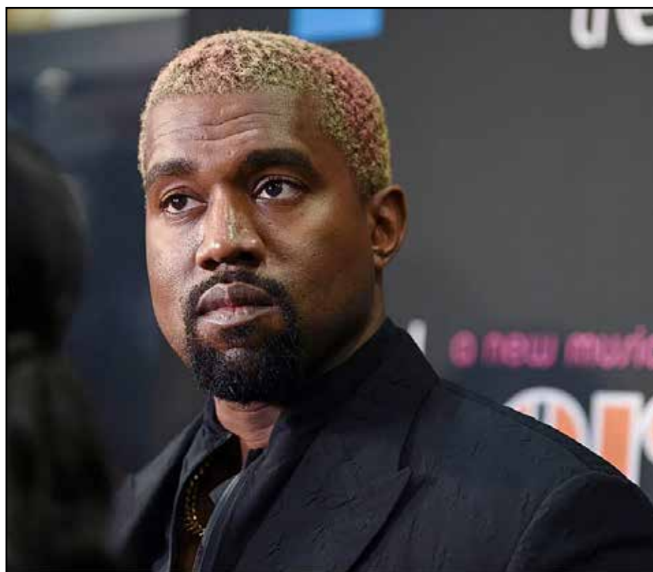
RAP ON THE KNUCKLES: The rapper has blamed some of his offensive comments on bipolar disorder

"Someone who has boasted of making tens of millions of dollars from selling swastika T-shirts and who released a song called Heil Hitler