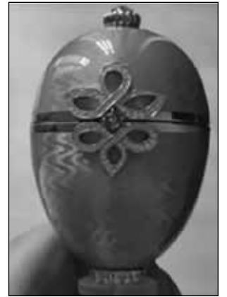
JUST FAB: police are still searching for the fabled egg, stolen from a handbag in a London pub