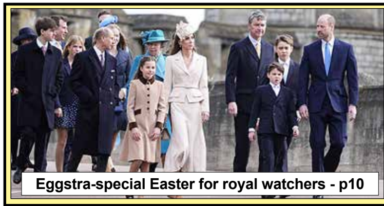
Eggstra-special Easter for royal watchers - p10

California's British Accent™ - Since 1984