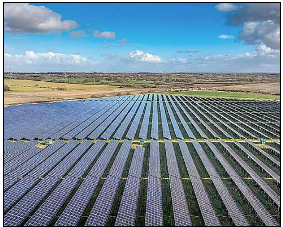
BLUE SKY THINKING: the view from biggest solar farm in Lincolnshire

Towards the end of last month, wind power climbed to a new high of 23.9GW, beating the previous record of 23.8GW