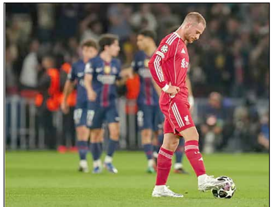
PASSIVE, NOT AGGRESSIVE: Liverpool endured a torrid night in Paris

further behind when Kvaratskhelia added PSG's second with a lovely piece of skill after rounding the keeper from Joao Neves' defence-splitting pass.