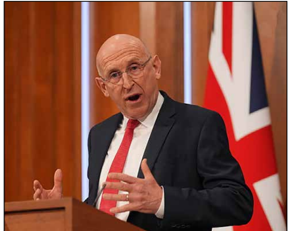
HEALEY: "I'm making this statement to call out this Russian activity..."

The Russian operation, Healey explained, demonstrated why the