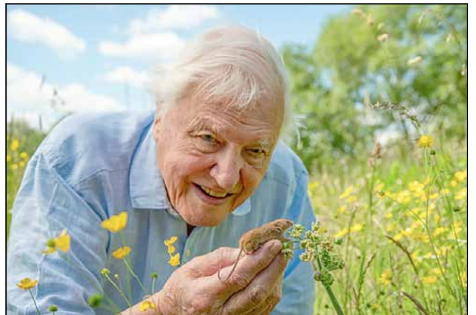
Sir David and a harvest mouse in a scene from his new TV show, Wild London

And good friend and fellow TV traveller Mi-