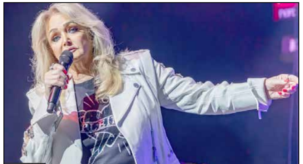
CANDID: The singer has been open about her health issues over the years

Since then, the star has sold more than 100 million records worldwide and is known for tracks like "Total Eclipse of the Heart." Earlier this week, a spokesman for