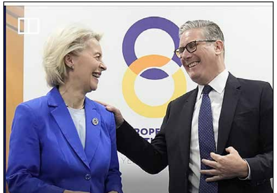
RECONCILIATION AHOY: Starmer shared a joke with EU Commission President Ursula von der Leyen on Monday

Two-thirds of it will be spent on bolstering Ukraine's defence needs