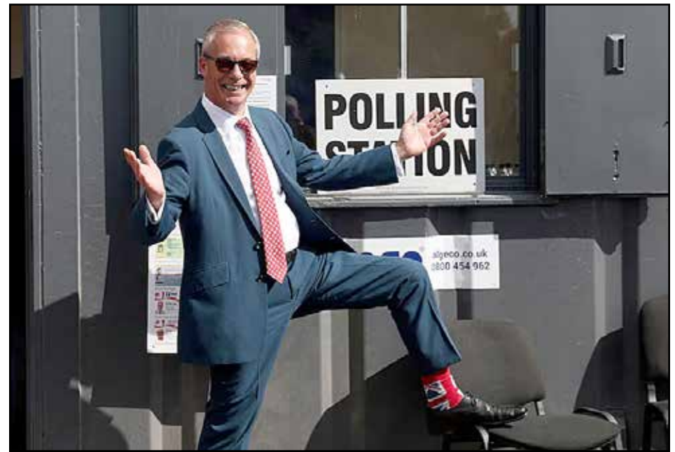
Outlook sunny: Nigel Farage poses at his local polling station on Thursday