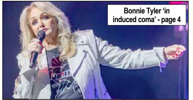
Bonnie Tyler 'in induced coma' - page 4

California's British Accent™ - Since 1984