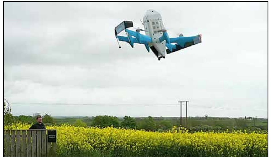
THE FUTURE: Amazon is trialling its drone delivery service near Darlington