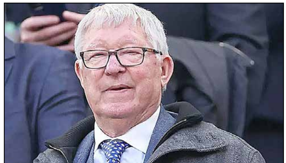
Sir Alex fell ill before Manchester United's crunch match with Liverpool on Sunday

As news of his illness spread at the ground, fans chanted the leg-