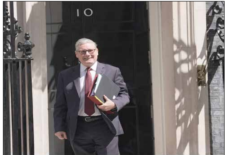
WHAT ME, WORRY? Sir Keir Starmer was all smiles as he left No., 10 on Thursday

Following Streeting's high-visibility quitting