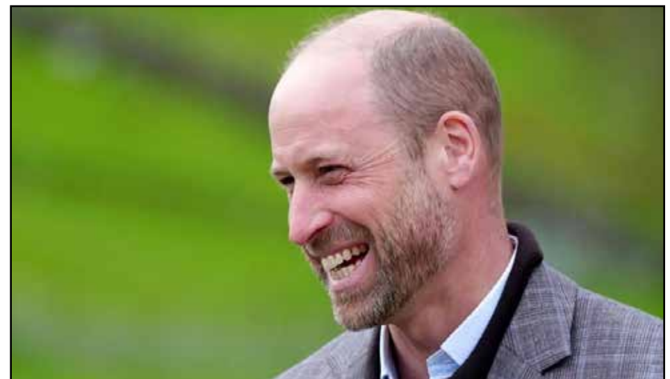
"We're not the traditional landowner... we want to be more than that. There is so much good we can do." - Prince William

The duchy has its roots in medieval, feudal land ownership, but it has been having something of an image makeover, with an emphasis on social value, such as providing affordable