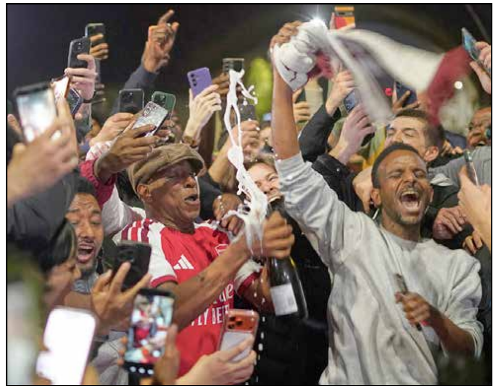
FANDEMONIUM: Ian Wright joins the celebrations outside the Emirates

The title win came in Mikel Arteta's seventh year in charge, and underlined just what can be achieved if a manager is given time.