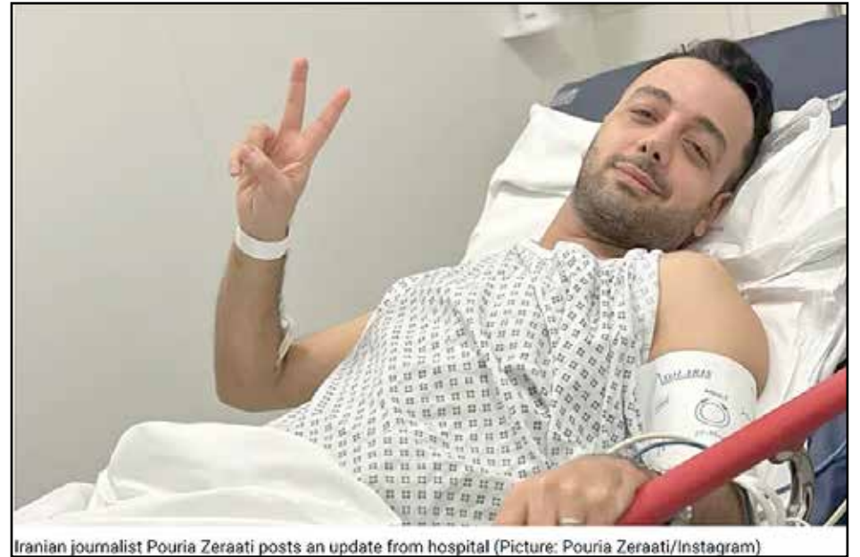
Iranian journalist Pouria Zeraati posts an update from hospital

The victim, Puriya Zarati, was a senior journalist at Iran International, a Persian-language TV station based in London linked to Saudi Arabia and the Iranian opposition.