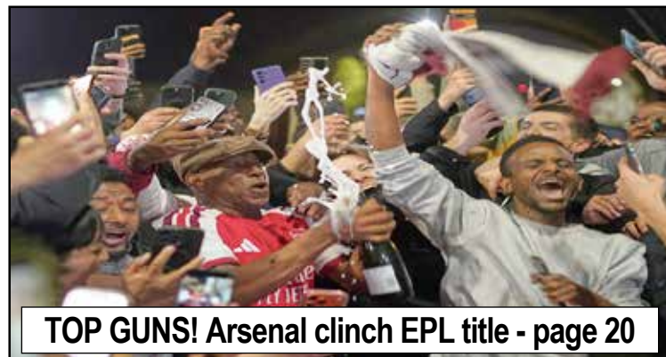
TOP GUNS! Arsenal clinch EPL title - page 20