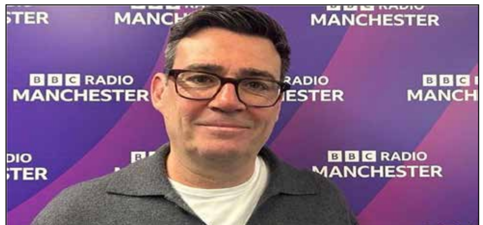
LEFT THREAT: Andy Burnham is standing as Labour candidate in the Megafield by-election

last week he declared a few days later that he would be a willing participant in any leadership contest, before angling for the pro-Europe vote by declaring that as Prime Minister, his first job would be to begin negotiations for the country to rejoin the EU.