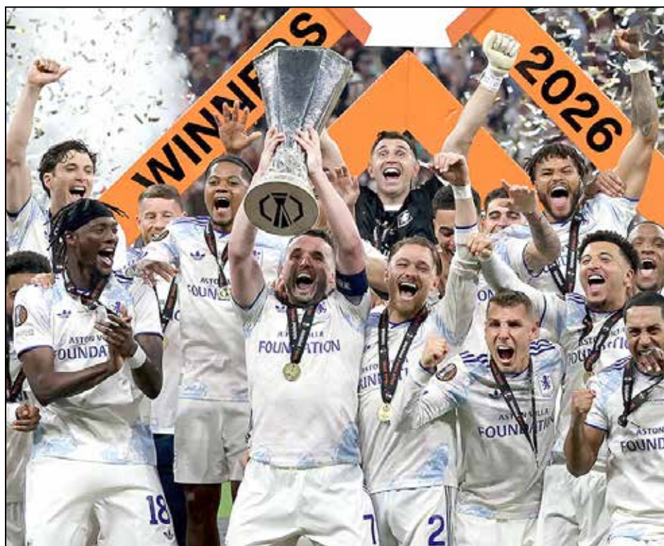
CUP THAT CHEERS: Aston Villa clinched the Europa League trophy Wednesday