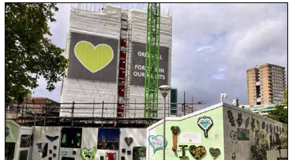
AFTER THE INFERNO: the June 2017 fire claimed 72 lives

Operation Northleigh, the £150m probe into the disaster of 14 June 2017, has examined the actions of 15,000 people across 700 organisations in the largest and most complex