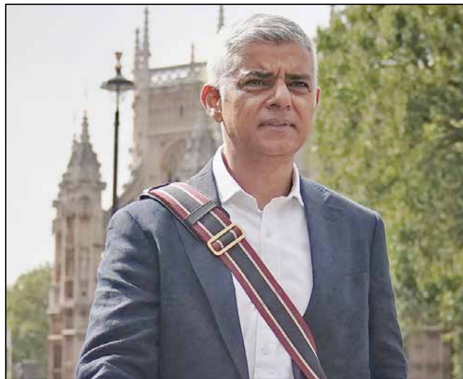
SAYING NO TO THE TECH BRO: London Mayor Sadiq Khan

A company's ethics cannot be taken into account during public procurement processes but the mayor's spokesperson said in a statement that Khan would raise the question of whether this should be changed with the government. City Hall's reasons for blocking the two-year contract to use Palantir's AI to automate intelligence analysis included Scotland Yard's failure to obtain Mopac's approval for its procurement